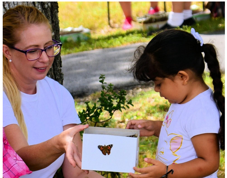
You can touch the butterfly!

On June 22, 2019, the City of Beeville and the Coastal Bend College hosted the third annual Bee Jamboree. The outdoor event is held the third week of June during National Pollinator Week. Bee Jamboree is hosted to build awareness about the importance of bees and other pollinators, discourage the use of pesticides in the local environment, and to encourage others to support pollinators by planting gardens and creating environments suitable for pollinators.