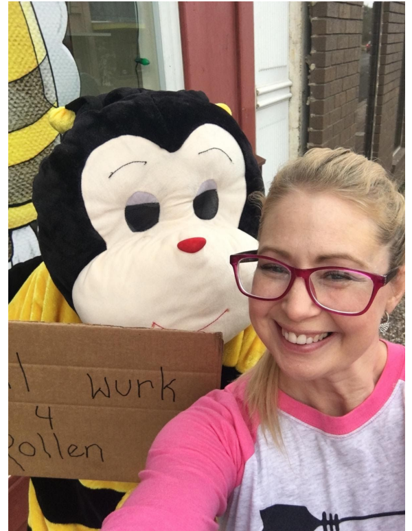
Will Work for Pollen

Social Media — https://www.facebook.com/BeevilleMainStreet