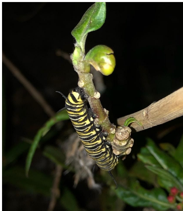
Monarch caterpillar in December

Plants included in the gardens are lantana, vinca, salvia, zinnias, impatient, marigolds, hibiscus, begonias, basil, citrus trees, and many more!