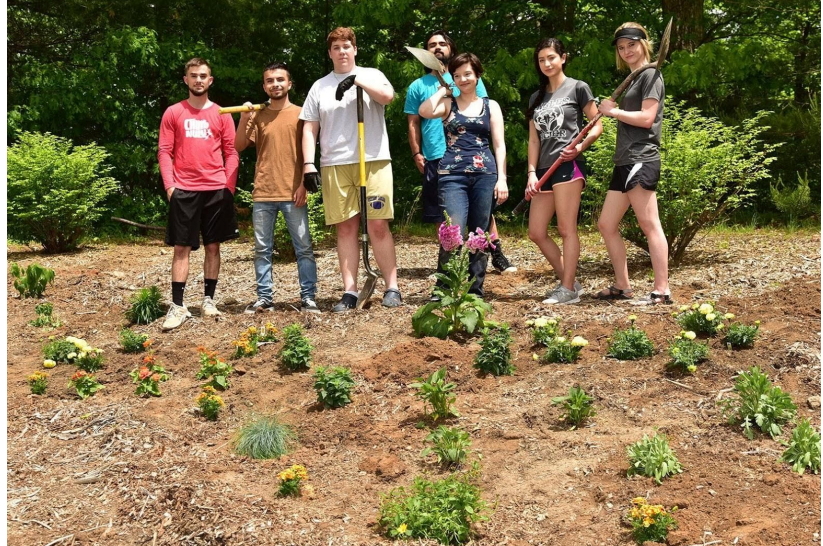
Student Leaders Plant a Monarch Waystation at Blue Ridge Community College