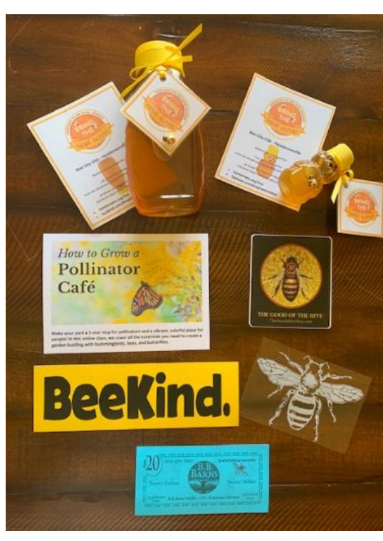
Bee City Hendersonville and Bee Campus Blue Ridge Share a Table at the Annual Harvest Celebration