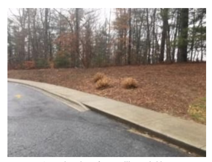
Area selected as a future pollinator habitat.

Through a gracious donation of seed from the NC DNR, Blue Ridge Community College was able to plant four Pollinator Friendly Habitats on campus encompassing over an acre of land. We are excited to see everything we planted come up this Spring!