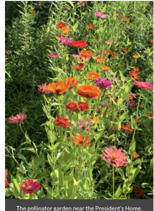
The pollinator garden near the President's Home