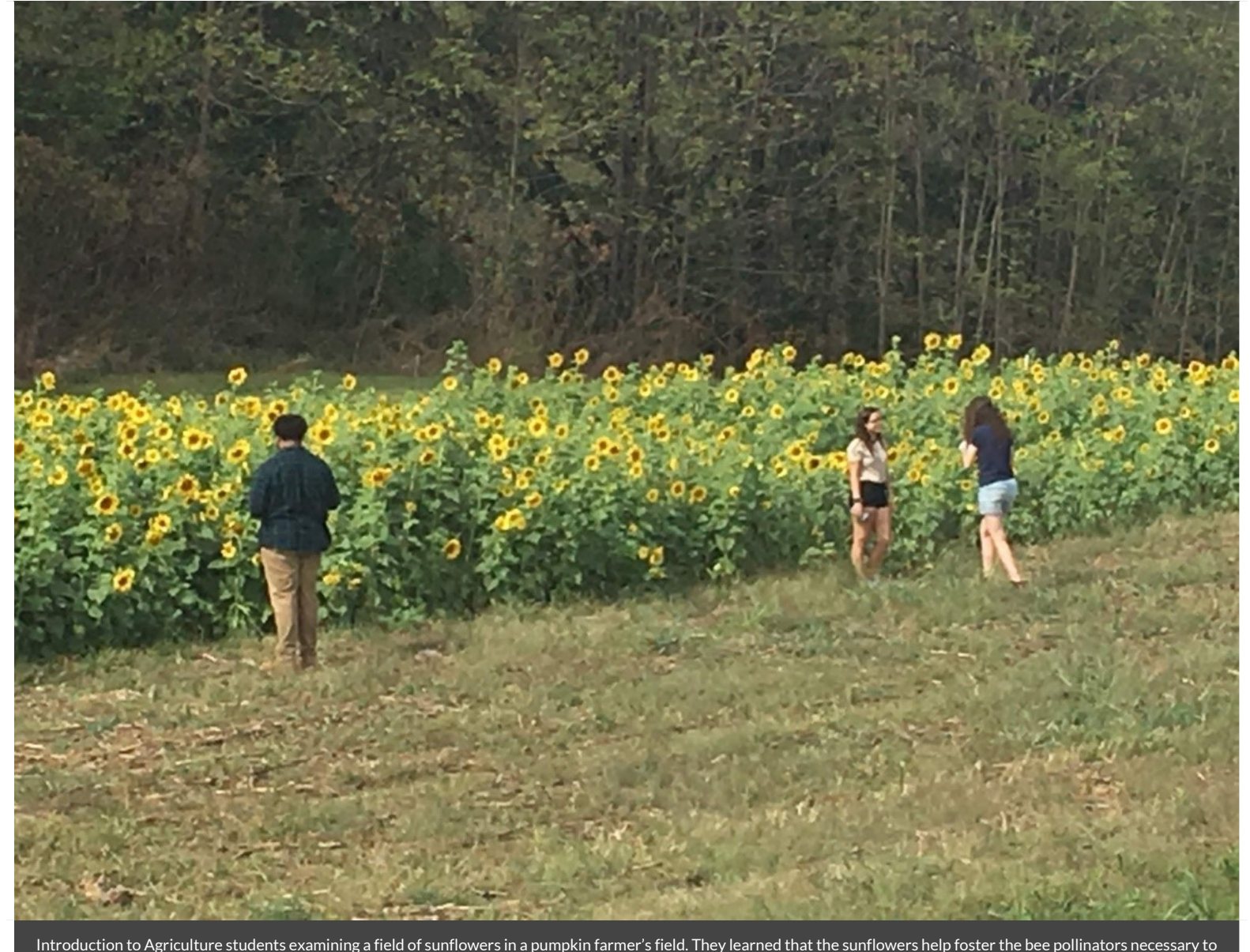
Introduction to Agriculture students examining a field of sunflowers in a pumpkin farmer's field. They learned that the sunflowers help foster the bee pollinators necessary to pollinate the pumpkin crop.