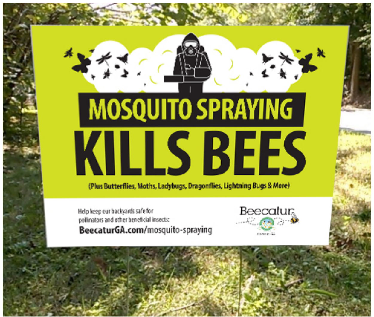
Yard signs are one component of a broad initiative planned for 2021 designed to discourage residents from spraying their properties against mosquitoes.

Recommended Native Plant List: <u>NATIVE PLANT LISTS_beecatur.pdf</u> <u>https://www.beecaturga.com/native-plant-lists</u> Recommended Native Plant Supplier List: <u>NATIVE PLANT GROWERS_beecatur.pdf</u> <u>https://www.beecaturga.com/native-plant-growers</u>