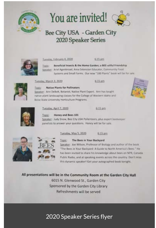
2020 Speaker Series flyer