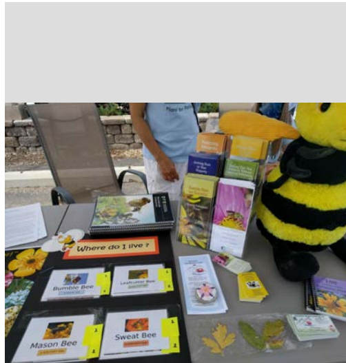
Educational material at Pollinator Celebration booth