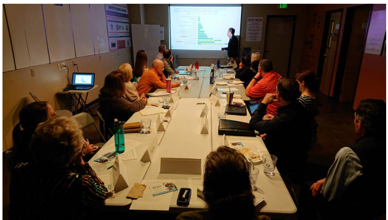
Sixteen members from the Hillsboro Environmental Stewardship Committee, which is comprised of passionate, diverse community members, listen to a report on pollinator efforts across the City of Hillsboro.

https://www.facebook.com/Hillsboroparks https://www.instagram.com/hillsboroparks/ https://twitter.com/Hillsboroparks