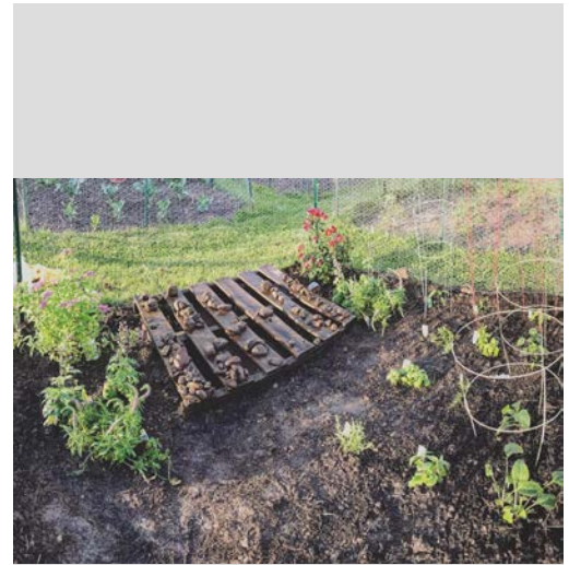
Bee Hotel After