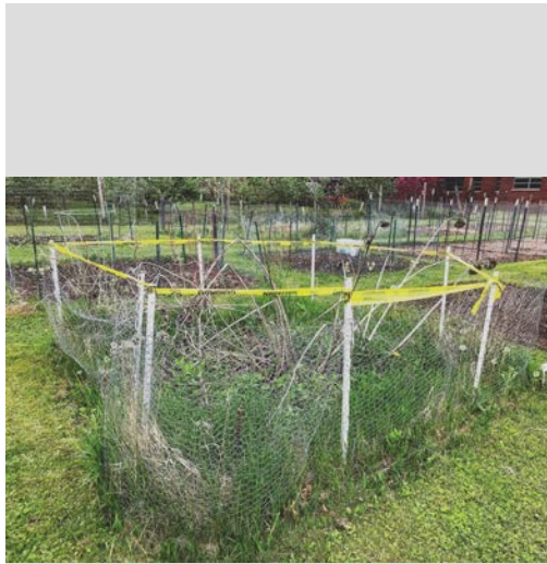
Garden Plot Before