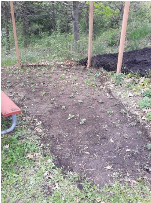
Pollinator Flower Garden

IHCC has taken many active steps in creating and increasing pollinator habitat this year. We had a student worker from the community garden commit one plot to pollinator friendly plants with a bee hotel in the middle. We also planted roughly 300 native plants on campus in the spring and summer. We were able to order bundles of plants from a local supplier that emphasized plants that the Rusty Patch Bumble Bee are attracted to. We were able to drastically increase our existing pollinator section of the community garden.