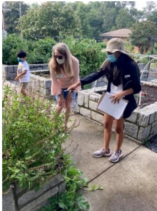
Pollinator Census Count Activity at the Norcross Community Garden