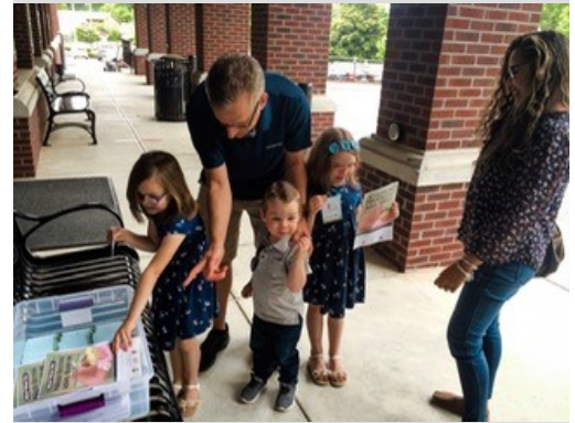
Small family picking up Pollinator Week Workbooks and Seed Packets