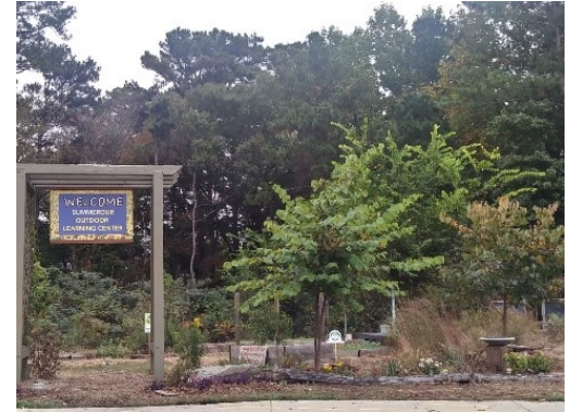
Summerour Middle School Garden