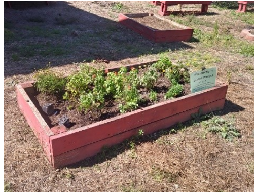
2. Beaver Ridge Elementary School Garden