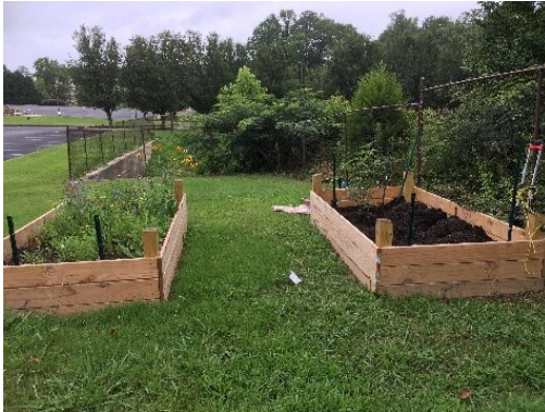
1. Brookhaven Innovation Academy School Garden

1. We helped plant pollinator gardens at four new Norcross Schools (Norcross Elementary, Beaver Ridge, Summerour, and Brookhaven Innovation Academy). We help create raised bed that the students can use to plant their own pollinator flowers and vegetables.