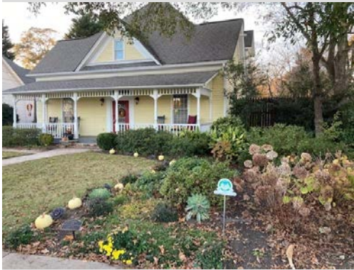
Pollinator Friendly Garden sign outside of a residential home that registered their garden through our program