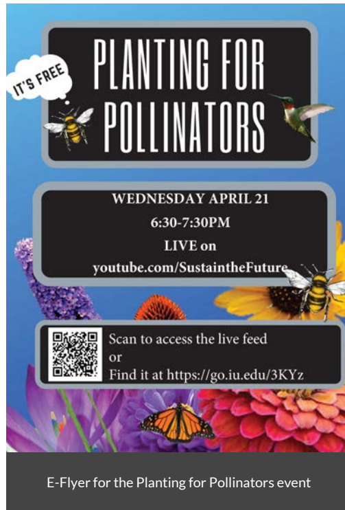
E-Flyer for the Planting for Pollinators event