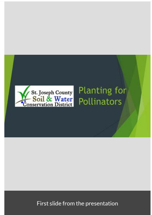
First slide from the presentation