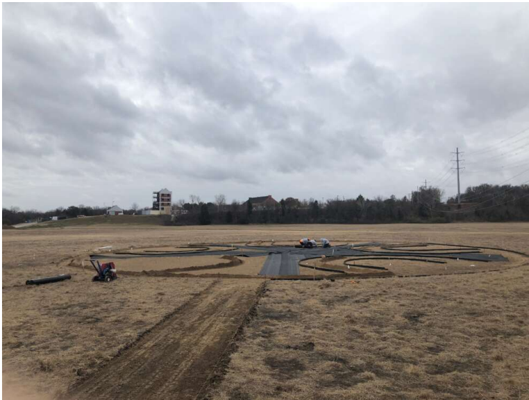
Lake Arlington Native Plant and Pollinator Garden Construction

In 2021, the City's Water Utilities Department partnered with the Tarrant Regional Water District to create a 2.75-acre native plant and pollinator garden adjacent to Lake Arlington. The plan also includes 5 raised garden beds which will highlight specific plant groups such as native pollinator plants and these beds will be sponsored and maintained by outside groups. The Bee City committee will be sponsoring one bed beginning in 2022. There will be a 1,260 sq. ft. group event area, 1,200 linear feet of walking paths and a parking area.