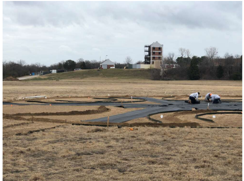
Lake Arlington Native Plant and Pollinator Garden Construction