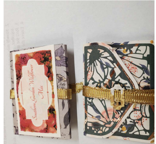
Distribute southern wildflower packets of seeds to residents of Bell Buckle