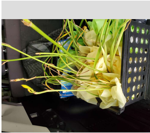
Disbritute daylily plants to residents of Bell Buckle