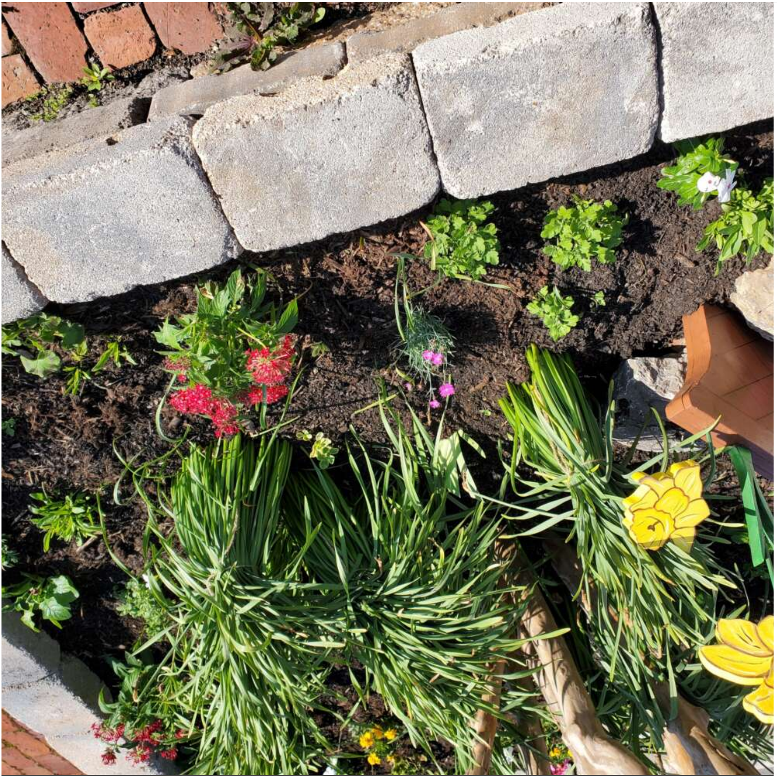
Planting of daffodils downtown in 4 beds