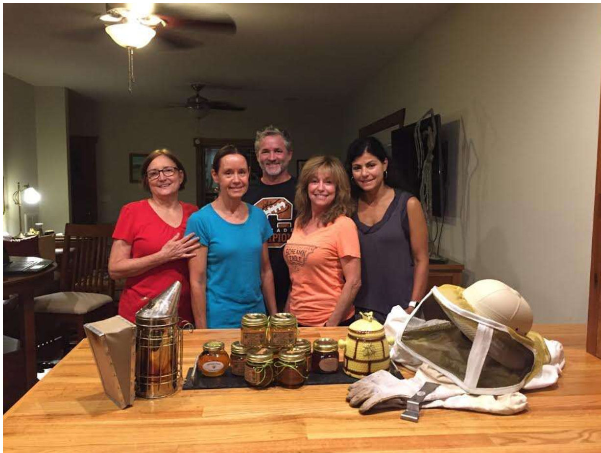
A great group of beekeepers to work together

https://www.facebook.com/search/posts/?q=bellbucklebackyards