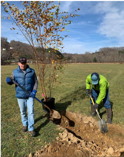
Town of Boone Mayor and Sustainability Manager Planting a Tree

Our community came together to plant a community garden located in Downtown Boone in order to provide fresh vegetables, fruits and flowers to whoever is in need. Additionally, our wetlands have recently been cleared of invasive species and woody tree removal in order to properly function as it should by our Public Works department. Around 174 trees were planted on a town owned property (Bolick Property), as well as over 1,000 live stakes and bushes in order to help restore the farmland to its previous natural state. Finally, 518 groups of flowers were planted in Town-maintained hanging baskets, around 1,100 individual annuals were planted around town and a new media was landscaped with Rose of Sharon and other various plants.