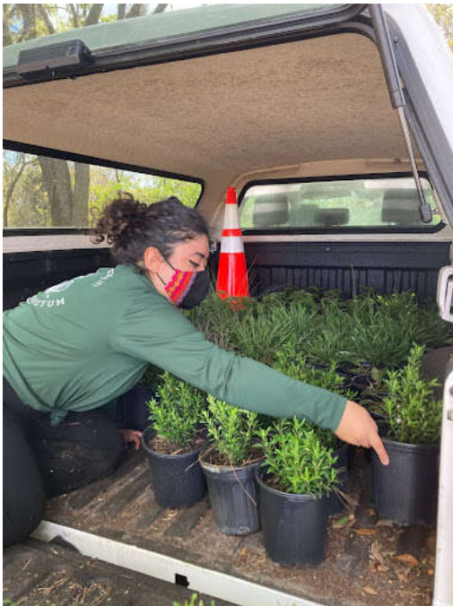
Nursery trip to Green Isle Nursery to get fill-ins to put into our Green House Garden.

In April of 2021 two habitat creation were put in, the BS garden and the Audubon garden. The BS garden is a revived garden that was sadly weeded over when covid hit. The Arboretum co-cos, interns, and volunteers weeded the area until it was ready to be planted in April and filled with meadow style plants including blanket flower, tickseed, raysless sunflowers, lakeside sunflowers, and elephantopus. This planting was done with the help of 5 volunteers. The same day the UCF Audubon Society with the help of the Arboretum planted a garden for pollinators and birds in the area, that now in maintained and cared for by the Arboretum Pollinator team. Plants in this garden include goldenrod, muhly grass, rattlesnake master, and elephantopus. In March of 2021 enhancements were added to our Green House garden including rosinweed, calamint, and blanket flower. These were done by Arboretum Bee campus and pollinator interns. In October of 2021 enhancements were added to our Greenhouse garden, Audubon garden, BA1 garden, Trevor colbourn hall garden, and BS garden. This was done with Arboretum Co-cos, interns, and 7 volunteers. Plants including dune sunflower, elephantopus, and pentas.