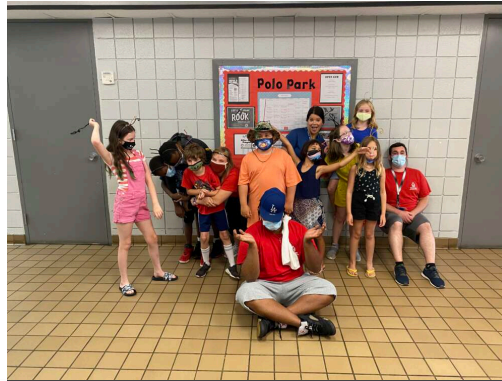
Polo Park campers enjoyed creating pollinator antenna and learning about pollinators.