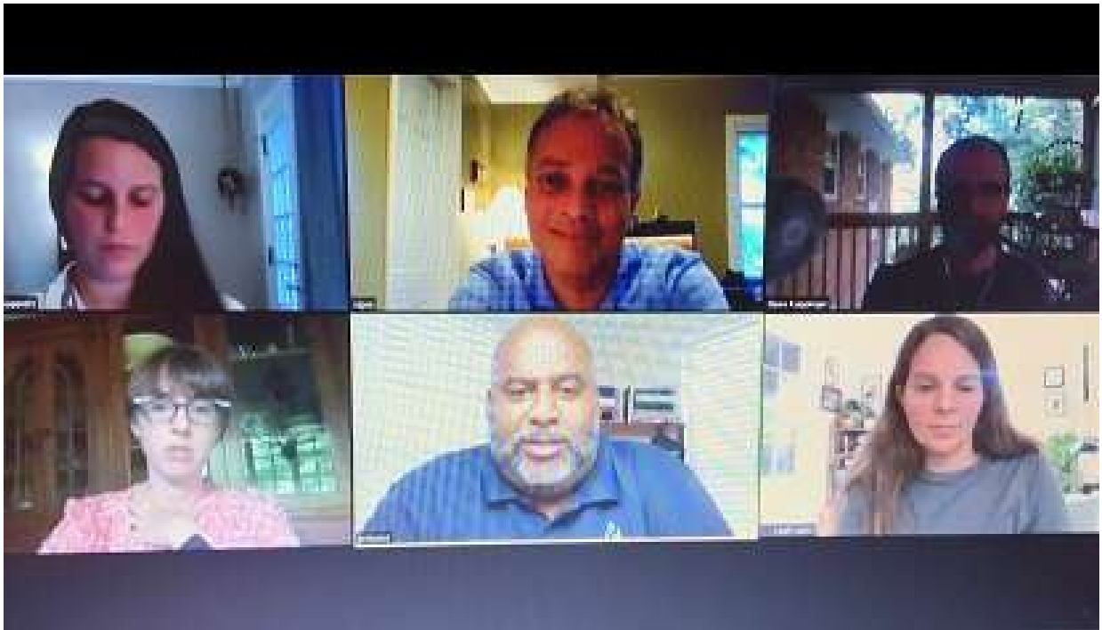
Virtual meeting of the Community Sustainability Program Committee.