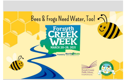
Virtual Creek Week Presentation to the Forsyth County Public Library - Southside Branch.