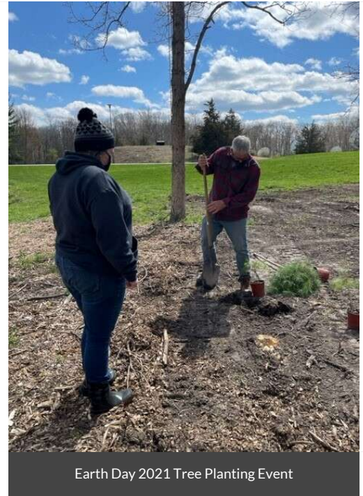
Earth Day 2021 Tree Planting Event