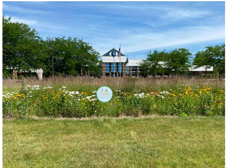
Main Campus Bus Loop