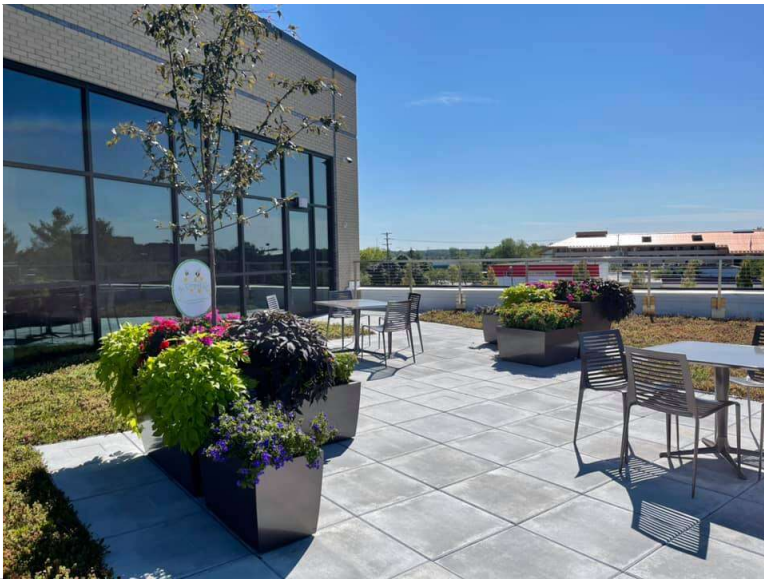
Midland Center Roof Garden