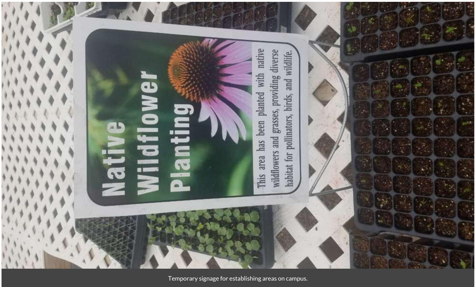
Temporary signage for establishing areas on campus.