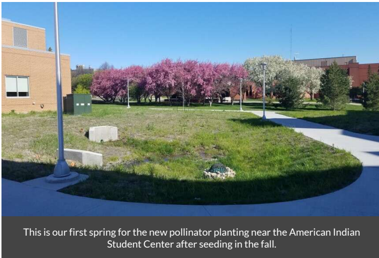
This is our first spring for the new pollinator planting near the American Indian Student Center after seeding in the fall.

Pollinator Bioswale, Agriculture Museum- This new installation was designed by an SDSU graduate student working with the Native Plant Institute here on campus. The project used a variety of native plants for pollinator support and engaged the Agricultural Heritage Museum in the process to help incorporate interpretive signage for the final outcome of a learning area at the museum. This is a high visibility area for a smaller scale, high diversity, planting. Pollinator Lawn Alternative, American Indian Student Center- We continue to weed and establish the native planting lawn alternative around our Native American Student Center on campus. Supplemental seeding was added to areas this season as well as some temporary signage to help highlight this area. We are having fun tracking the establishment as the planting gets more dense. Next season we will add additional seeding and hopefully some permanent signage. Native grass planting at Raven Precision Agriculture- We incorporated a large native grass planting of little bluestem, dropseeds, and grama on one of our new building projects on campus. These areas should help provide habitat for insect pollinators and other wildlife. We plan to supplement these grass plantings with forbs as they become dense and established.