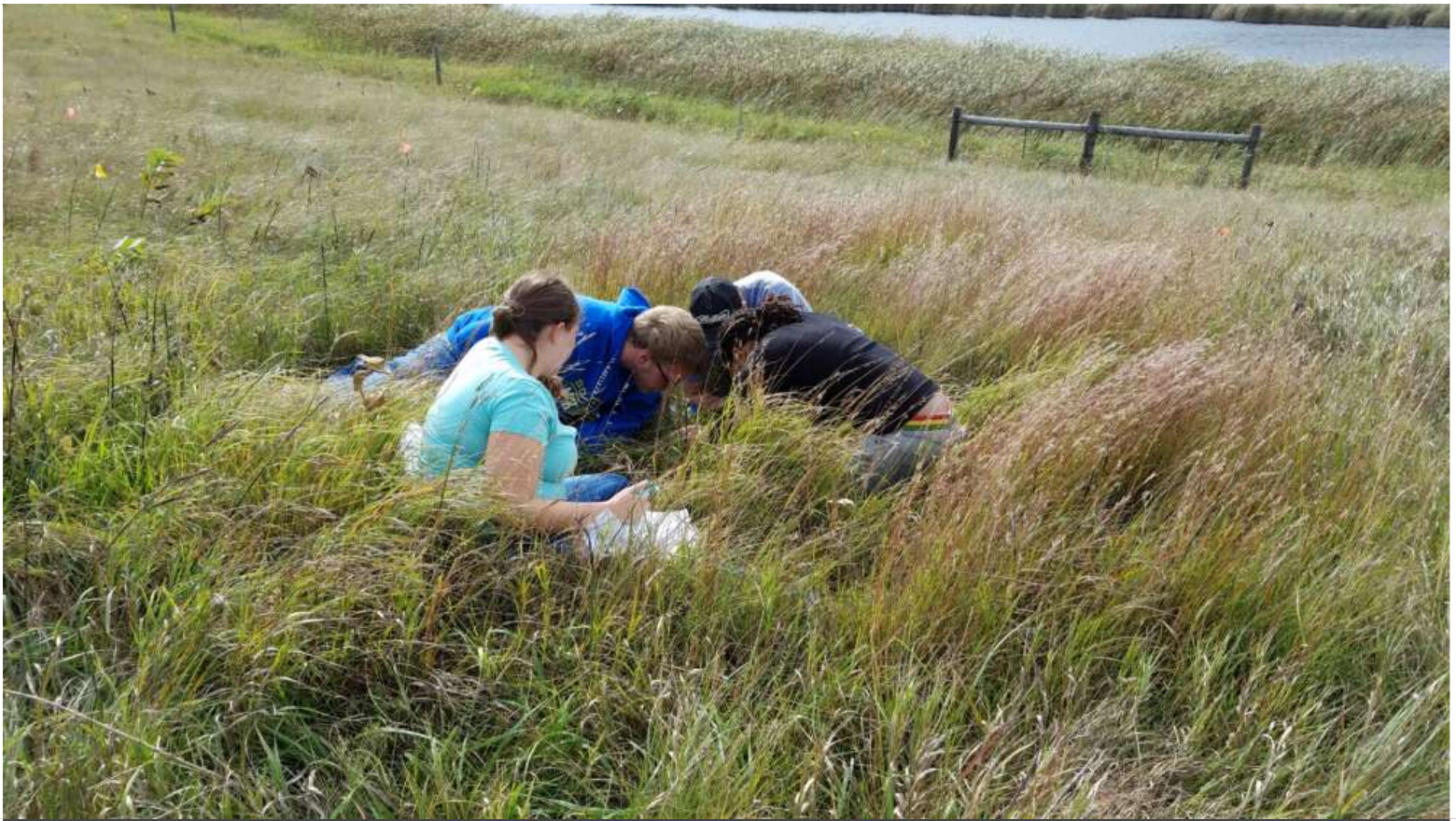
Students of Natural Resource Management take inventory on the Aurora Prairie near South Dakota State University.