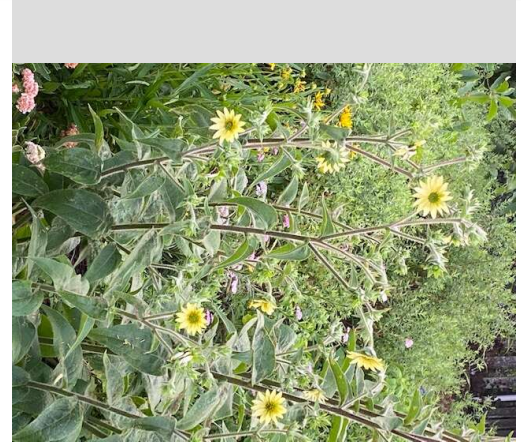
Helianthus silphioides , commonly called rosinweed sunflower or Ozark sunflower, blooming in June-August.