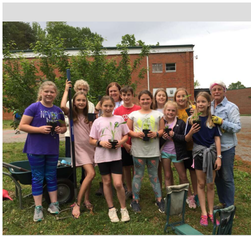
Working with students at Fairyland Elementary School Pollinator and Monarch Waystation garden.