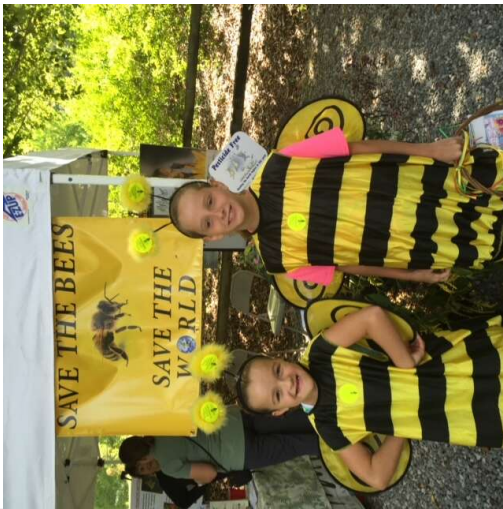
Promoting pollinators at Reflection Riding's native plant sale.

Talks to local groups including children about pollinators and native plant gardening. Hosted the presidents of various garden clubs on Lookout Mountain to promote Bee City USA mission, the planting of public places with native plants, and pesticide-free planting zones. Attended 6 committee meetings for the development of Fairy Trail Garden. Provided plant lists, including Butterfly and Moth host plants for Fairy Trail Garden and Fairyland School. Donated books, posters and other materials to Fairyland Elementary School library and classroom on pollinators. Set up a Native bee house in the pollinator garden for students to observe bees that nest in cavities. Provided seeds for students to participate in The Great Sunflower Project.