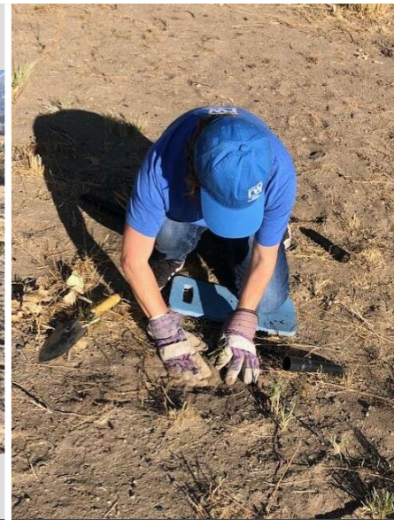
River Wonders staff plant a native pollinator plant