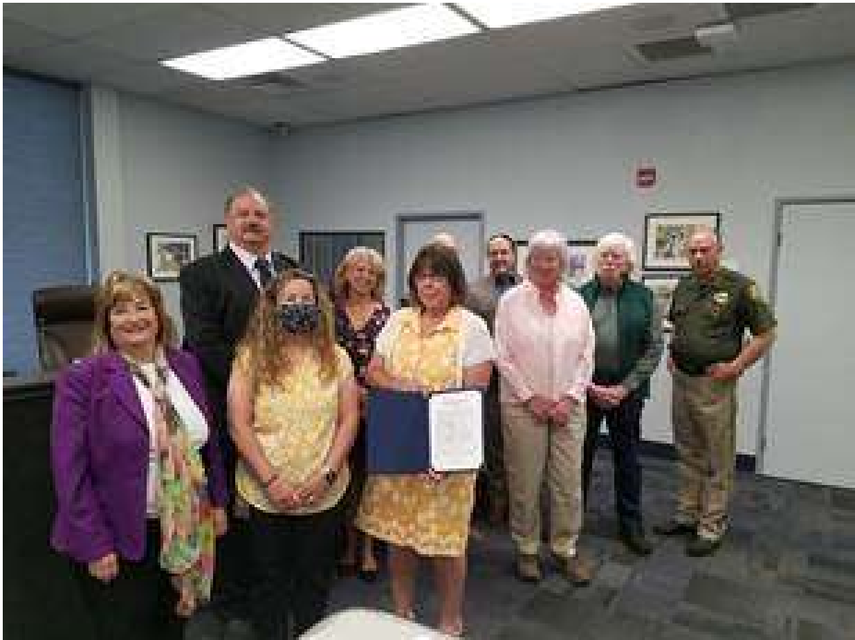
Carson City Mayor, Board of Supervisors, Bee City #76 Committee and others celebrating our Pollinator Month Proclamation.