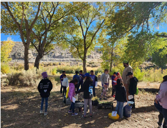
Elementary students help plant pollinator plants