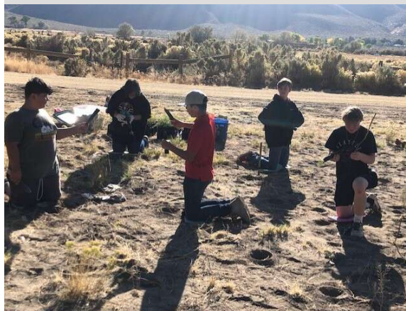
Boys and Girls club kids assist with pollinator garden planting