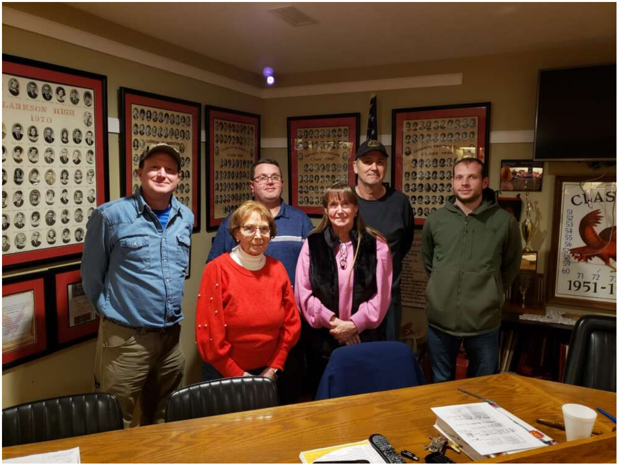
The Clarkson City Commission/Bee City USA Committee consists of the Mayor, City Commissioners, and City Clerk-Treasurer.