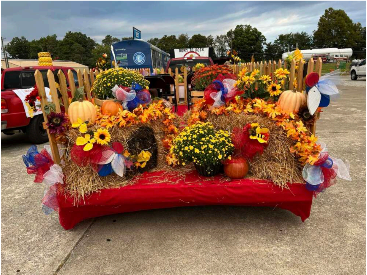
The backside of the City of Clarkson 2022 Honeyfest parade float.