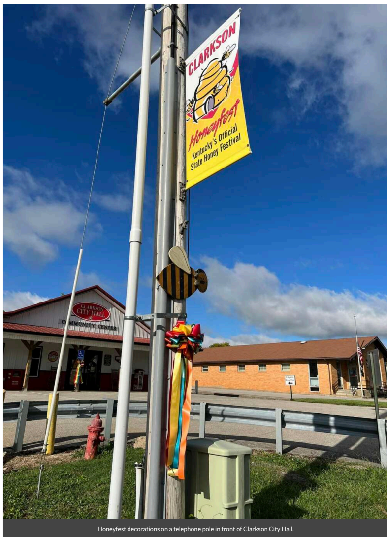
Honeyfest decorations on a telephone pole in front of Clarkson City Hall.