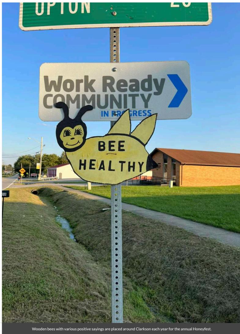
Wooden bees with various positive sayings are placed around Clarkson each year for the annual Honeyfest.