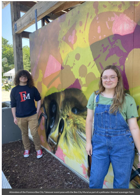
Attendees of the Florence Bee City Takeover event pose with the Bee City Mural as part of a pollinator-themed scavenger hunt.