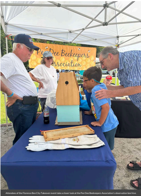
Attendees of the Florence Bee City Takeover event take a closer look at the Pee Dee Beekeepers Association's observation bee hive.