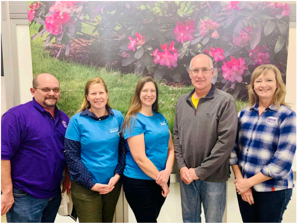
Bee City USA committee made up of Keep Grapevine Beautiful Board members and supporting staff.