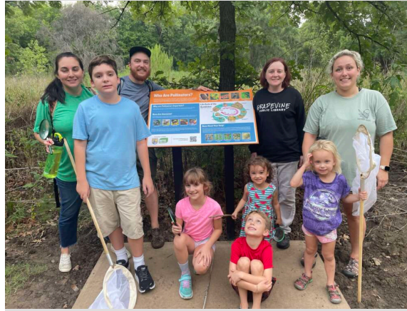
Families attend the Parks for Pollinators K12-off event next to new interpretive signage at the Park Pollinator Prairie.