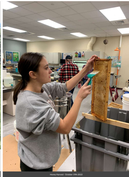
Honey Harvest - October 19th 2022