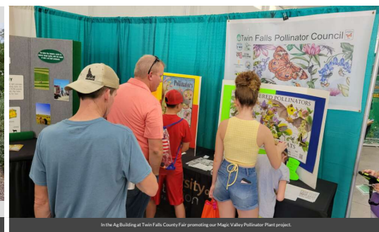
In the Ag Building at Twin Falls County Fair promoting our Magic Valley Pollinator Plant project.