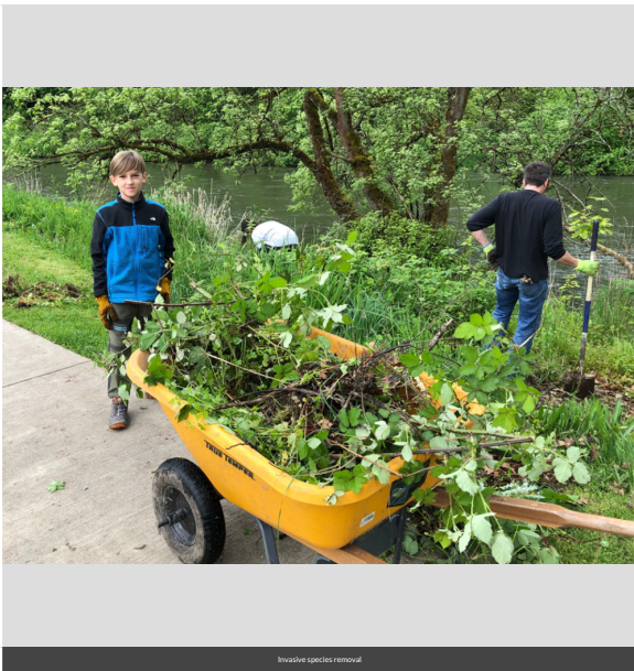
Invasive species removal