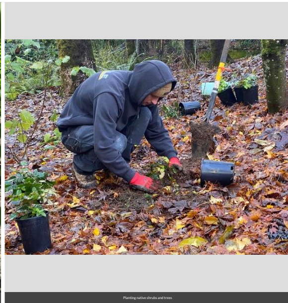
Planting native shrubs and trees