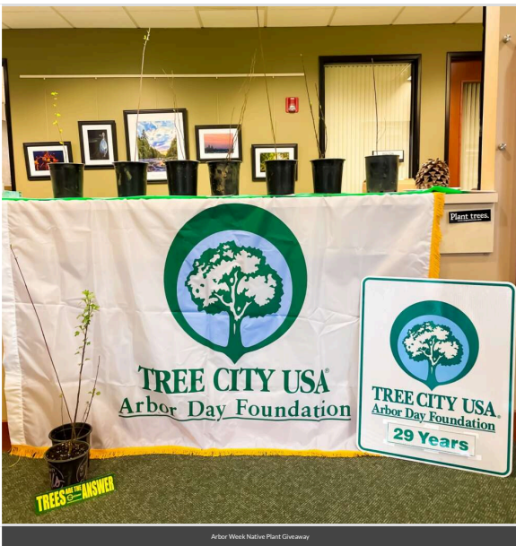
Arbor Week Native Plant Gateway