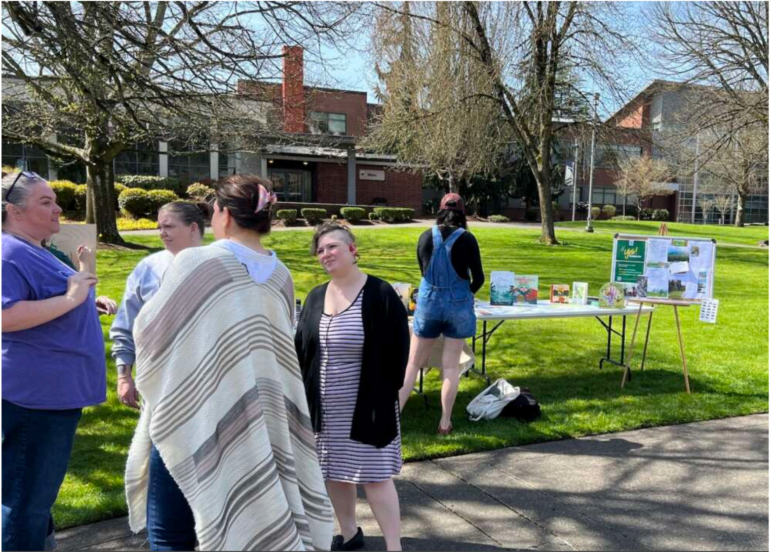
Earth Week (April 2023) on campus - Bee Campus information (and Arbor Day, too).