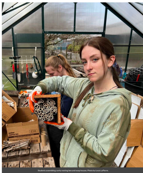
Students assembling cavity nesting bee and wasp houses.