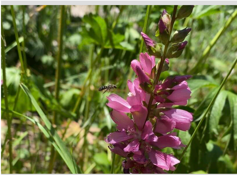
Sweat bee ( Halictus sp.) approaching Henderson's Checkermallow ( Sidalcea hendersonii ) growing in the campus garden.