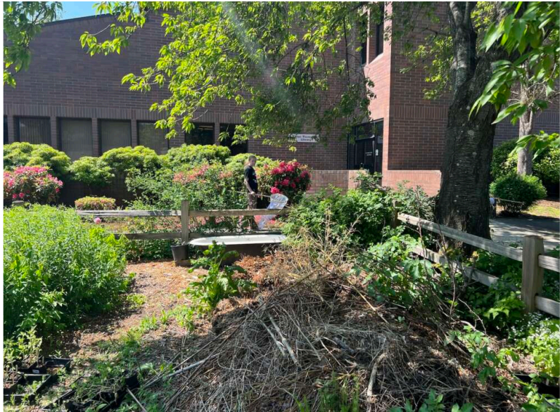
Corner of campus garden showing debris pile in foreground, spirea and narrow-leaved milkweed in clump to left, and snowberry and Nootka rose along the fence in the back.