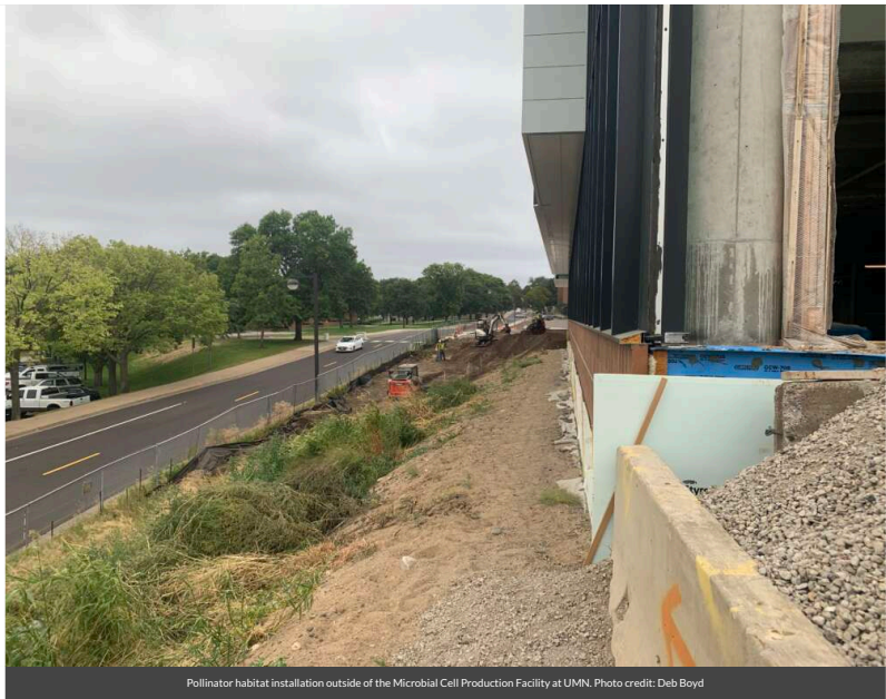
Pollinator habitat installation outside of the Microbial Cell Production Facility at UMN.