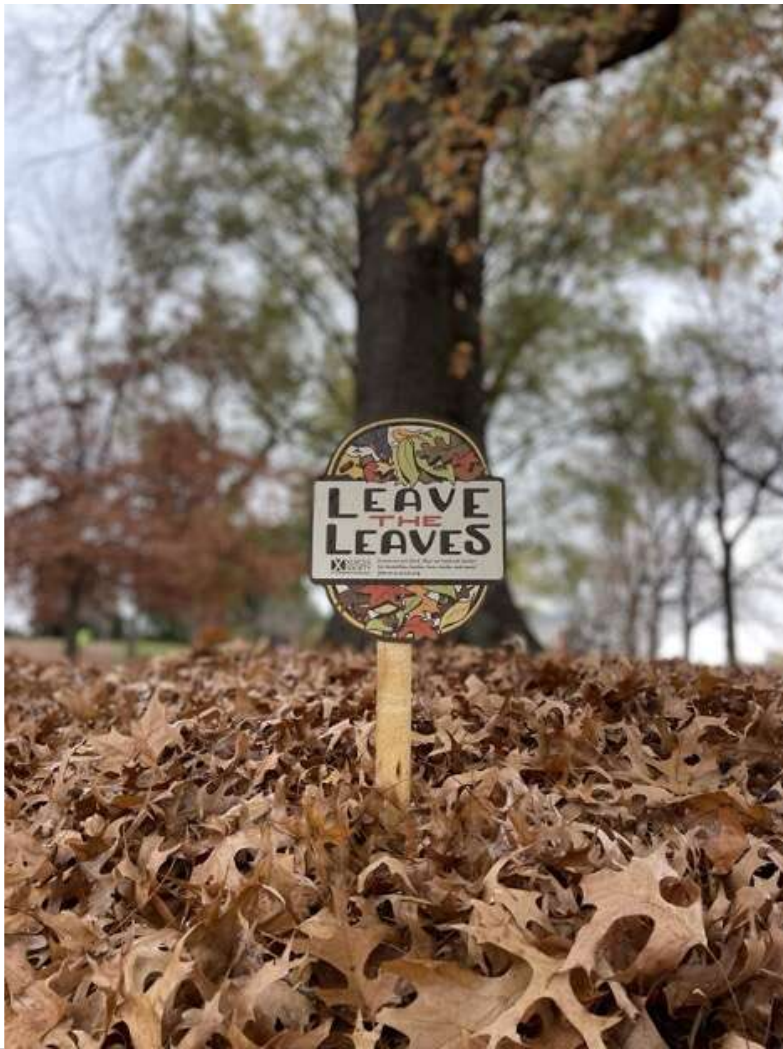
Sign provided by Xerces Society that are kept year-round in areas that have been established for leaf litter to accumulate and decay naturally. This photo and sign are on Carr's Hill, the residence of the University's President.