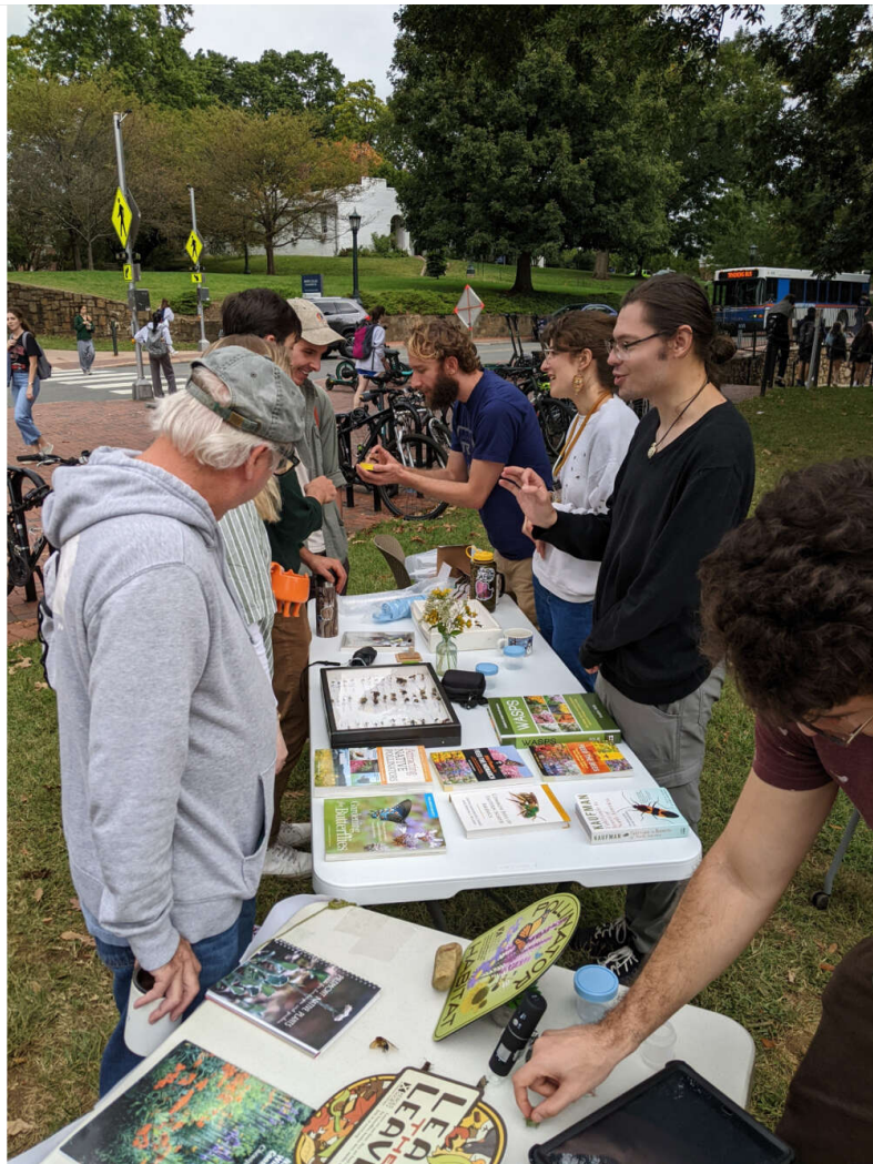
At our iNaturalist and Chill event, students gathered to learn about native pollinators and interact with educational books about pollinators, native plants, and pinned specimens.