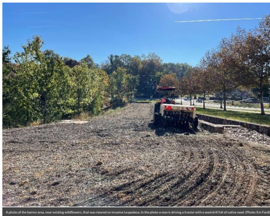
A photo of the barren area, near existing wildflowers, that was cleared on invasive Legumes. In the photo a man is driving a tractor with a seed drill full of native seed.