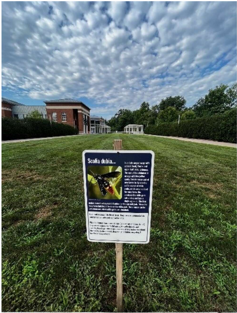
Informational signage for the blue-winged wasp, Scolia dubia , who is a visible summer resident on UVA's Grounds. Many complaints were received about these wasps with the assumption that they are dangerous, so signs are erected around their usual hunting grounds in summer while they are most active to edify faculty, students, and visitors on their harmless nature and explaining their behavior.