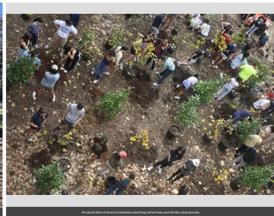
An aerial shot of several volunteers planting native trees and shrubs using dozers.