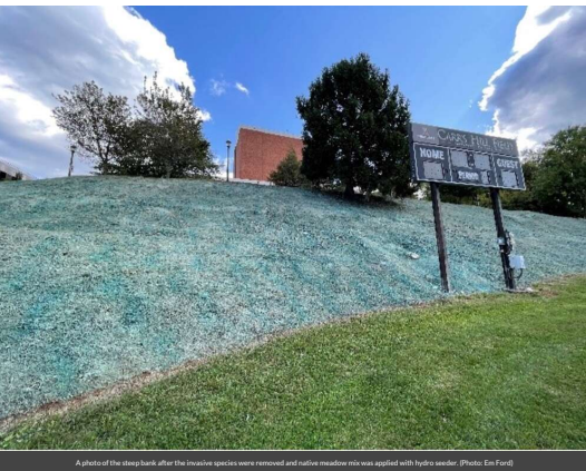
A photo of the steep bank after the invasive species were removed and native meadow mix was applied with hydro seeder.