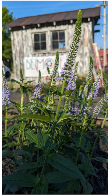
Pollinator Garden Grand opening - Jaime Lisi