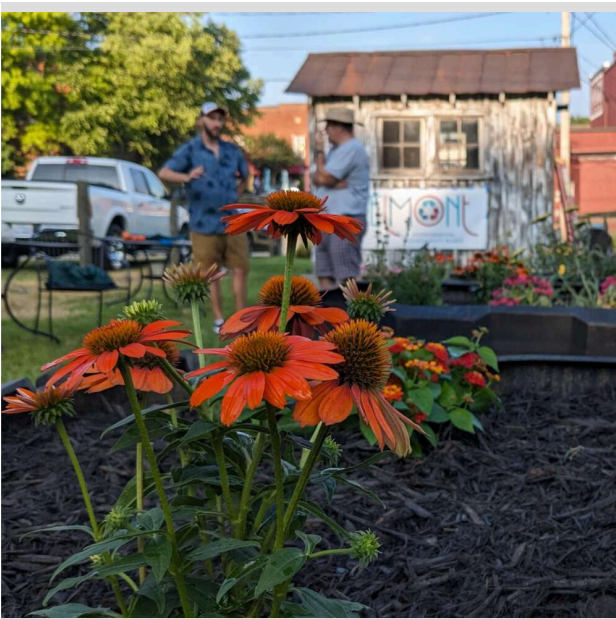
Pollinator Garden Grand opening - Jaime Lisi