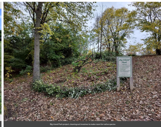
Big Island Park project, clearing out invasives to make room for native species