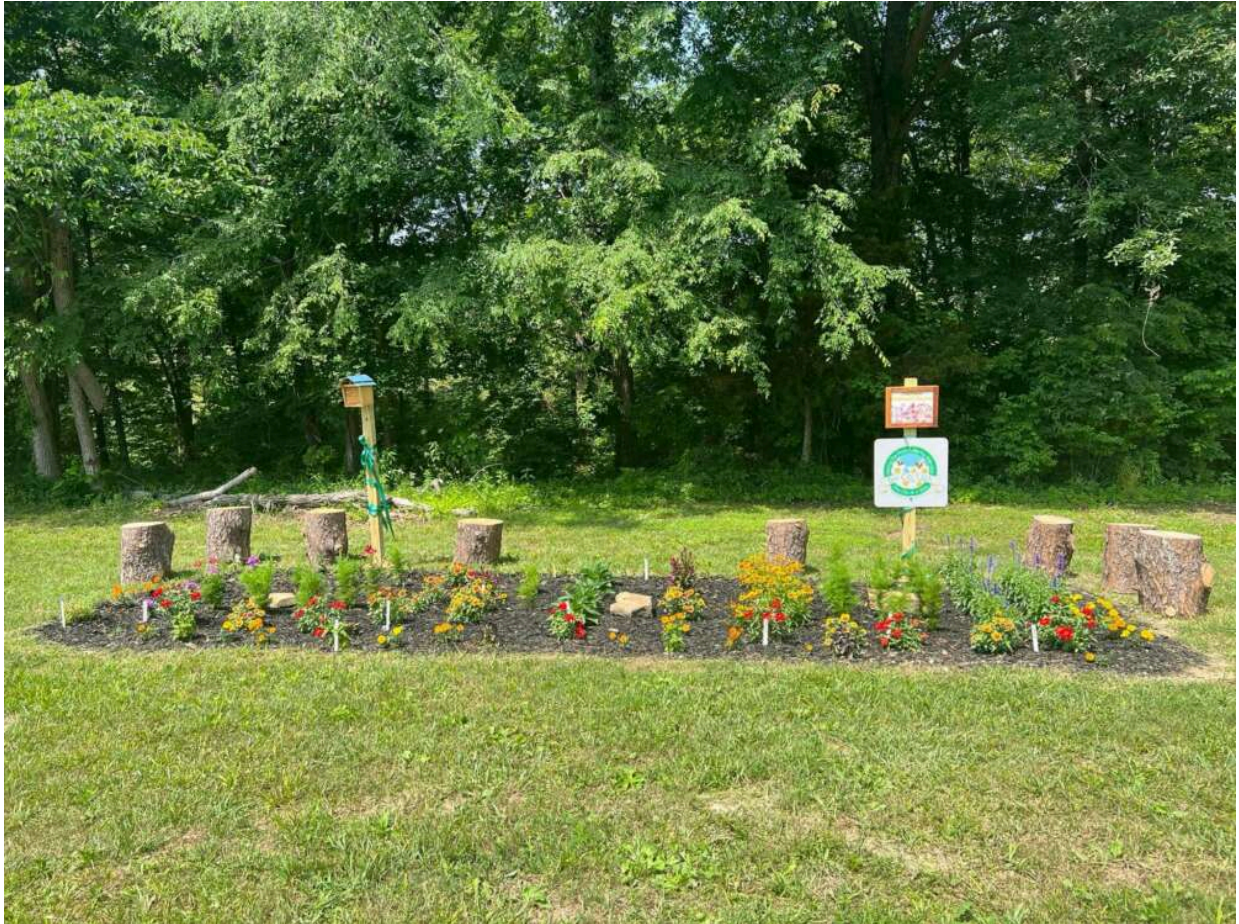
The City of Clarkson Pollinator Garden with the mason bee nesting box, Bee City USA sign, and dedication plaque in the background.

Every little bit helps when it comes to protecting bees and other pollinators.