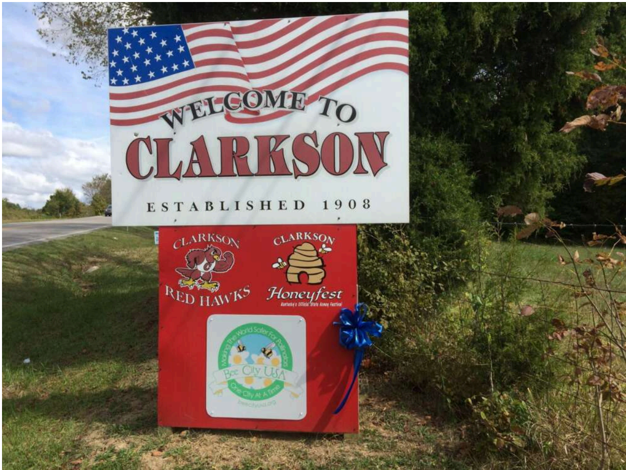
Bee City USA street sign on one of welcome signs into the City. (The City hopes to upgrade our Bee City USA signs to the new Bee City logo in the next year or two)