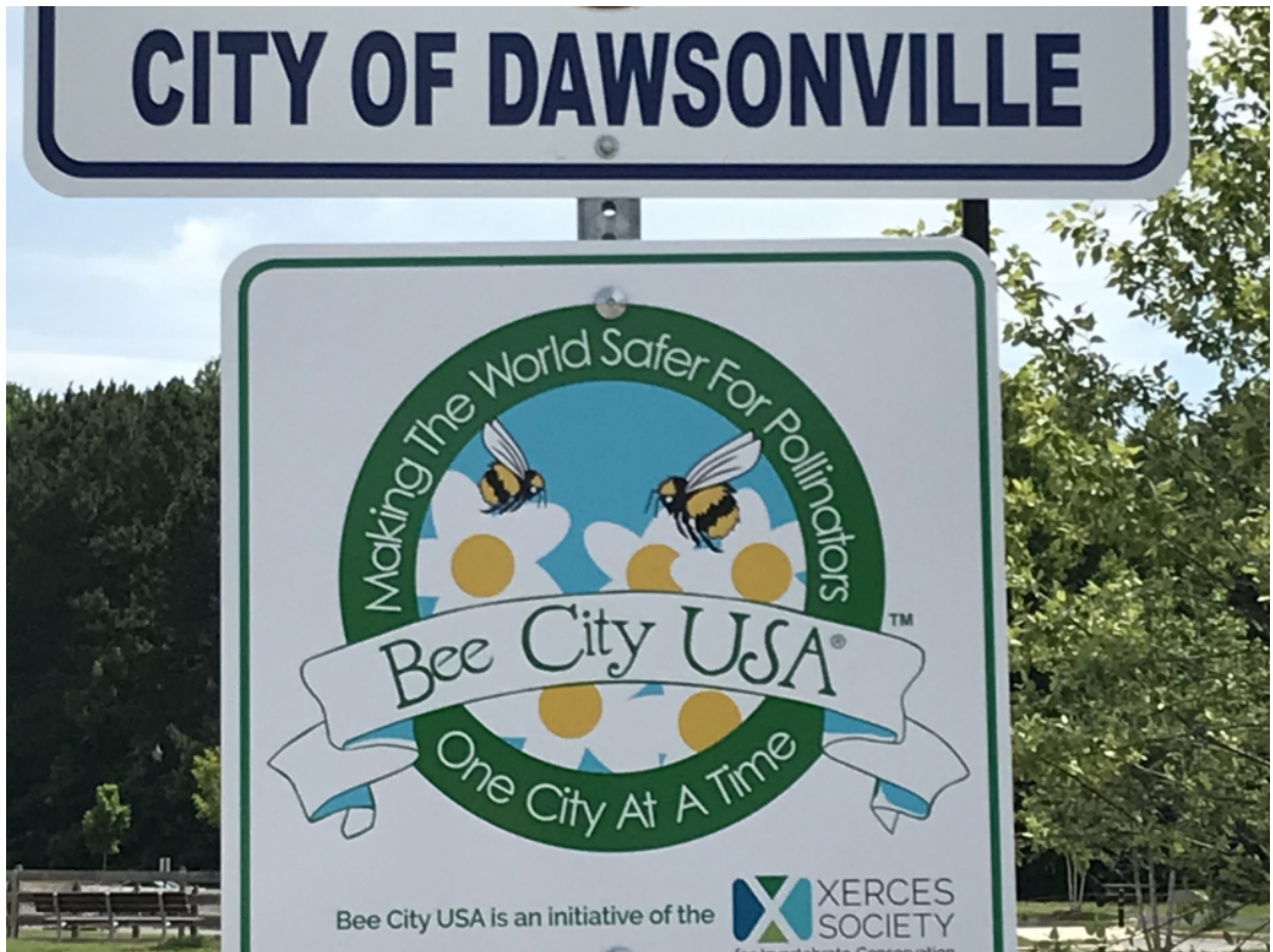
One of five Bee City USA signs in Dawsonville, GA.