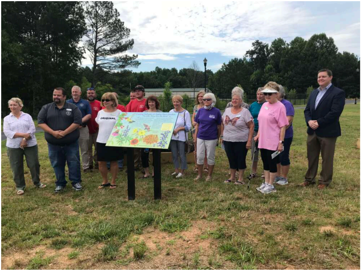
The Bee City USA committee who are members of the Dawson County Woman's Club and the city of Dawsonville staff.