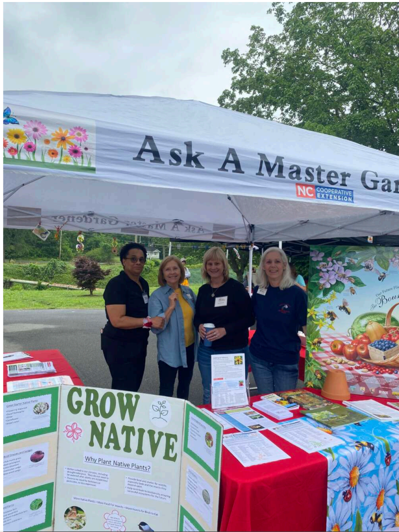
Master Gardener volunteers are always ready to answer any question!