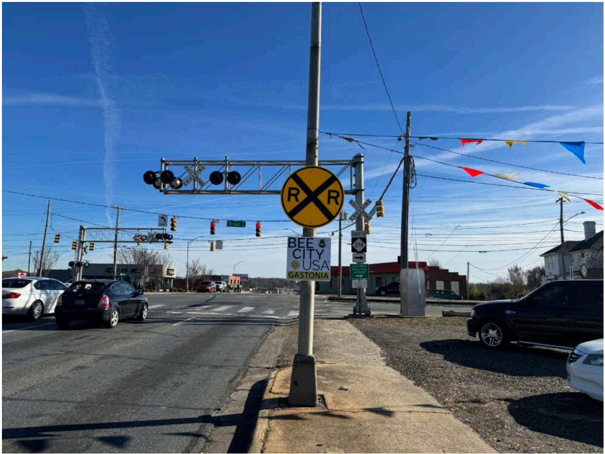
New Bee City USA sign at one of our major cross roads in Gastonia.