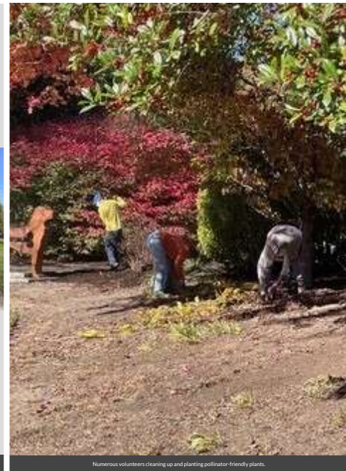
Numerous volunteers cleaning up and planting pollinator-friendly plants.