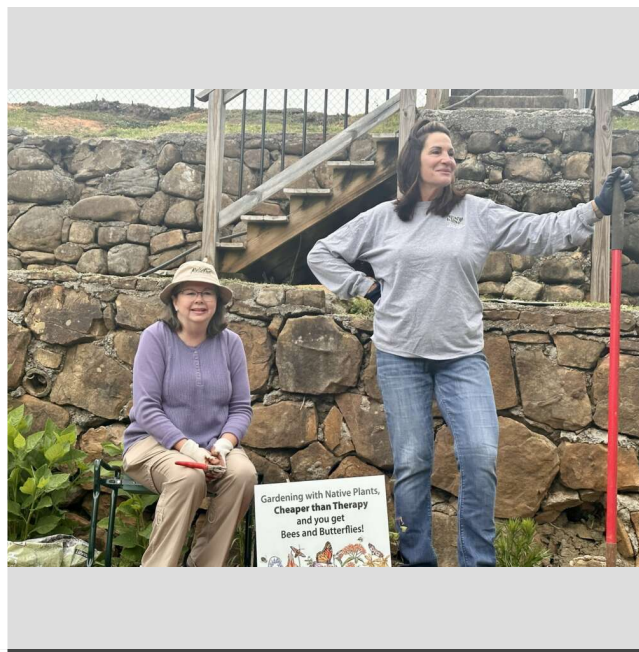
Bee City volunteers planting at the Plant America Pollinator Garden.