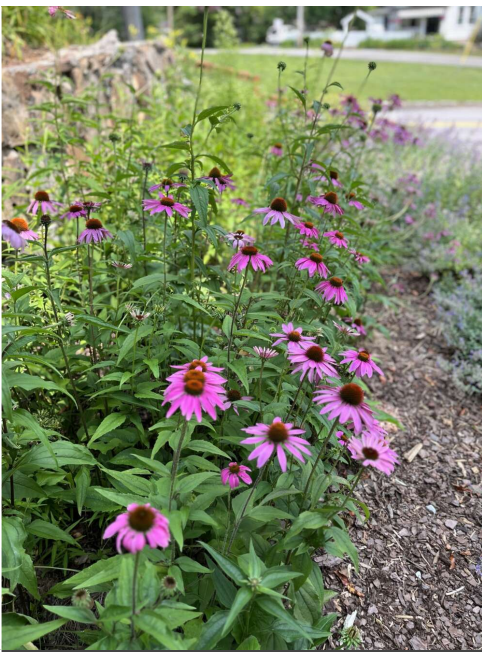
June blooms in Plant America Pollinator Garden