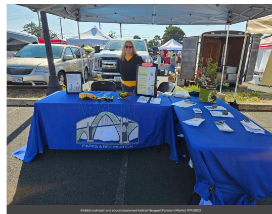
Bioblitz outreach and educational event held at Newport Farmer's Market 9/9/2023