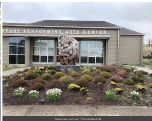
Pollinator Garden at Newport Performing Arts Center #2