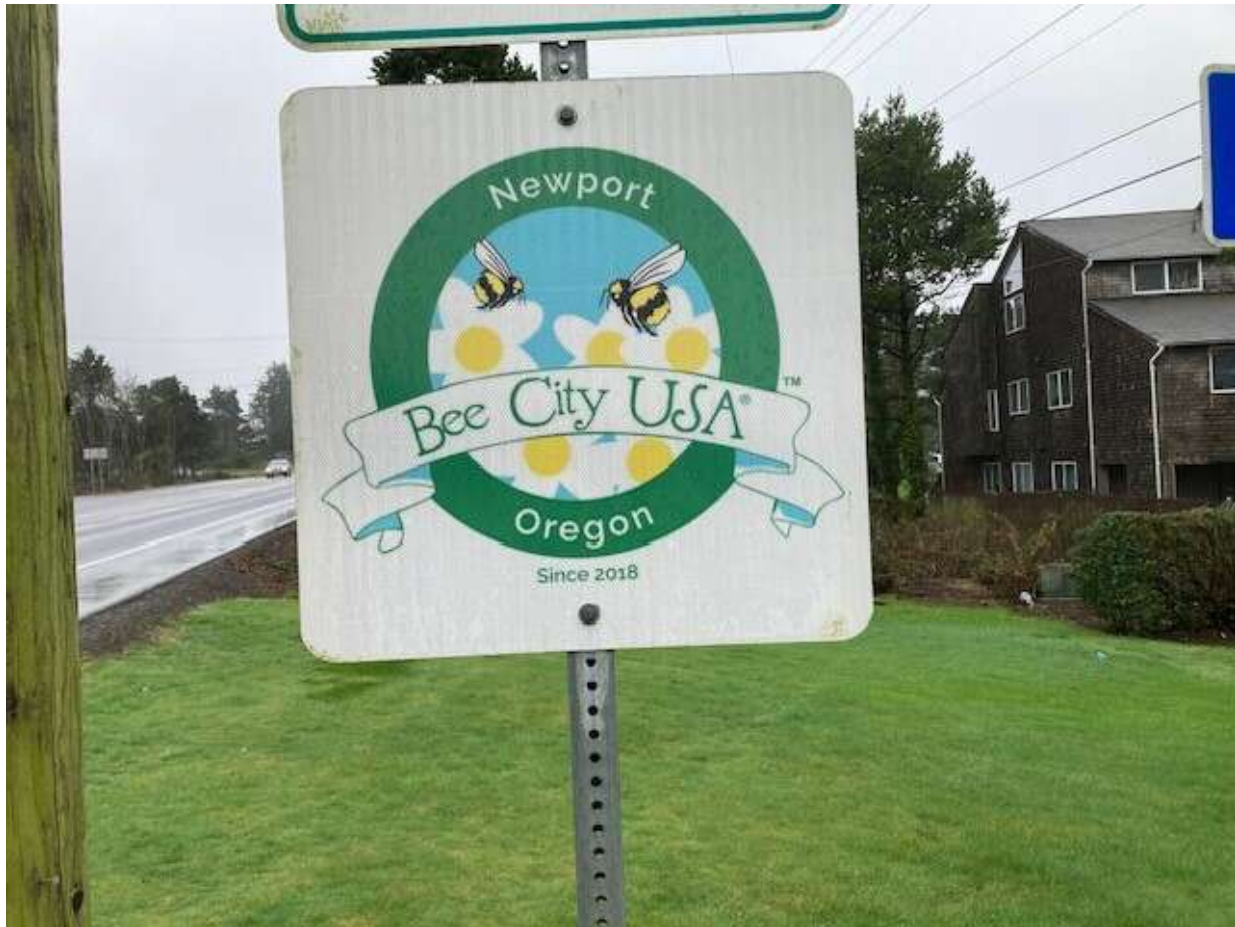
Newport Bee City sign on Hwy 101 entering town

Pollinator Garden at Newport Performing Arts Center, Newport Parks and Recreation