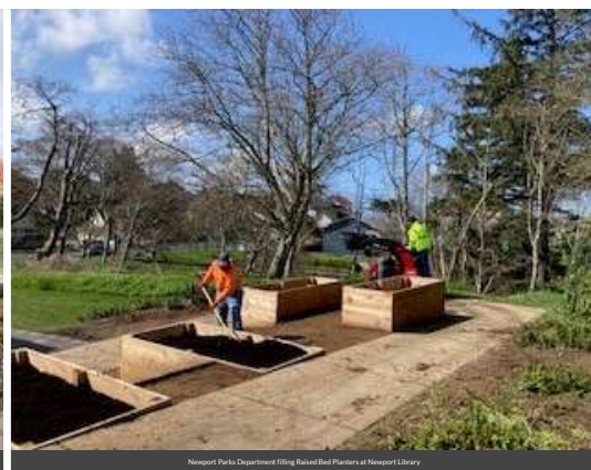
Newport Parks Department Filling Raised Bed Planters at Newport Library