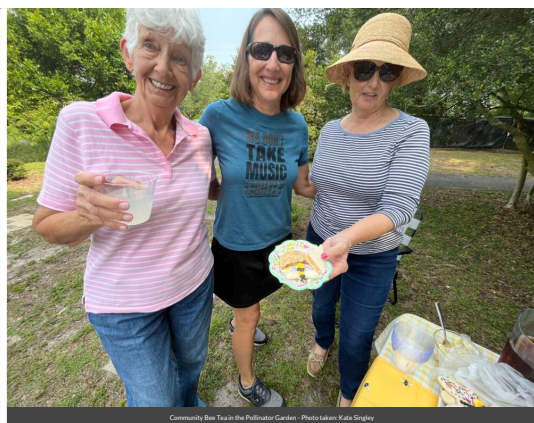
Community Bee Tea in the Pollinator Garden