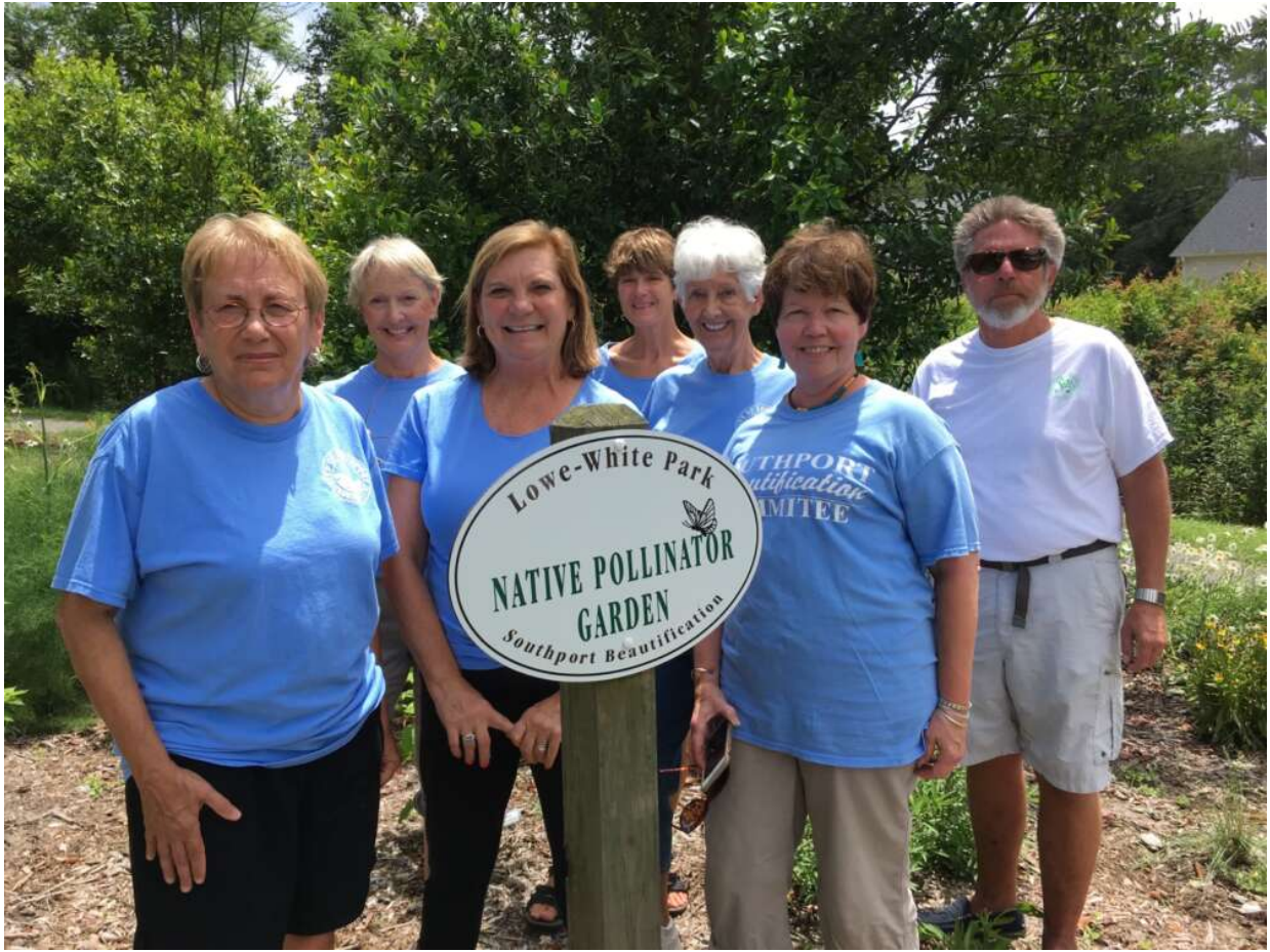
Part of Committee, not all in photo