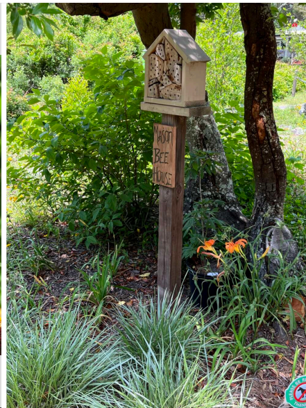
Wooden Bee House in the pollinator garden