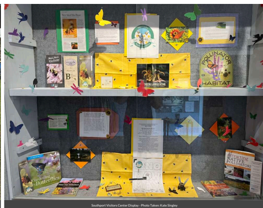
Southport Visitors Center Display