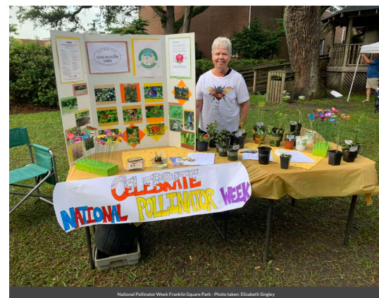
National Pollinator Week Franklin Square Park