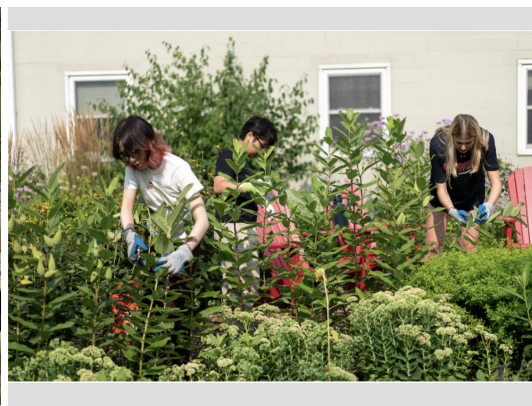
Service Learning: Garden work day and clean-up with campus partners, June 2023.