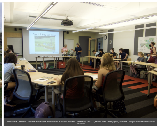
Education & Outreach: Classroom Presentation on Pollinators to Youth Camp from Community, July 2023.