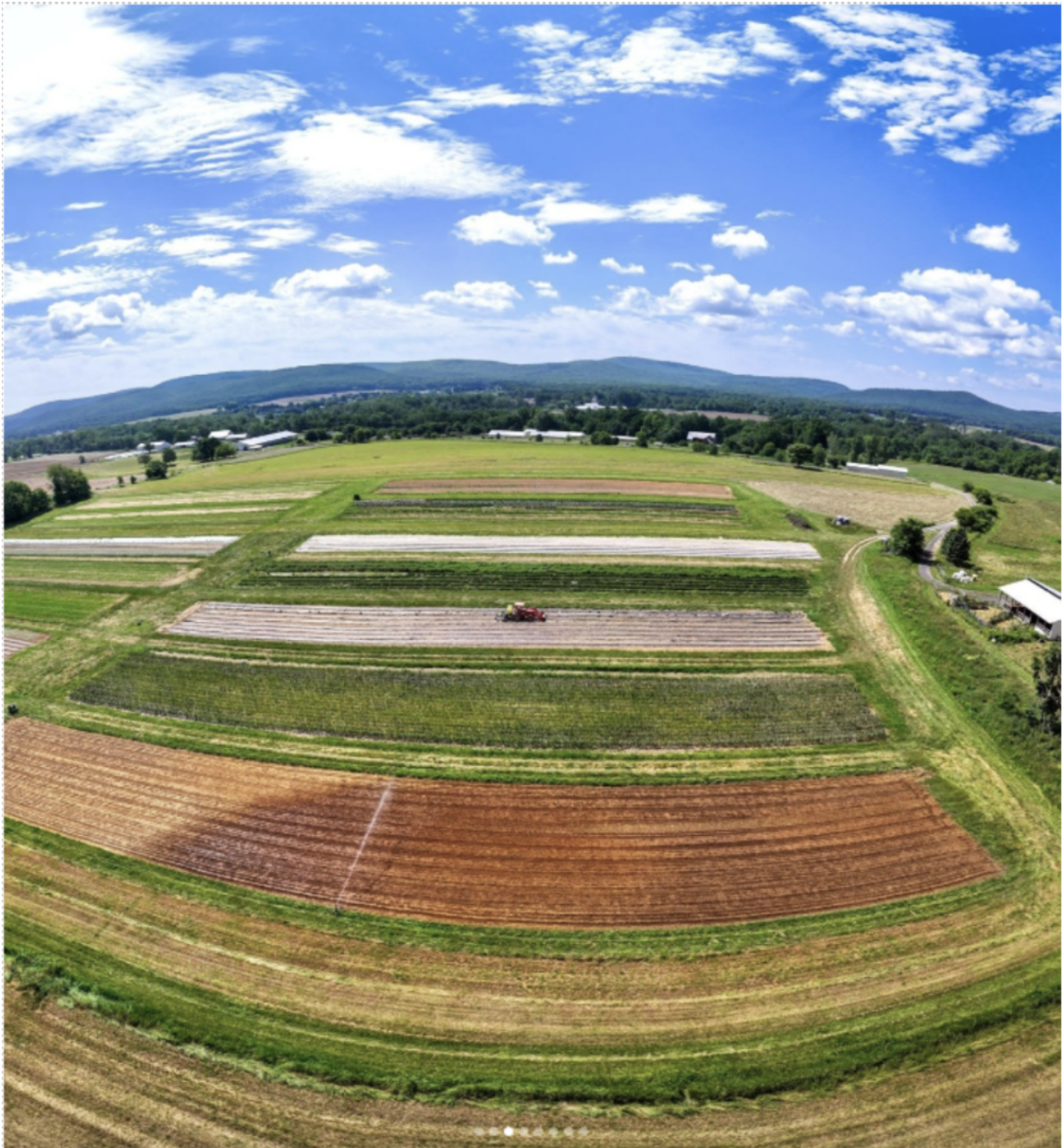
Policy & Practice: Dickinson College's farm uses Integrated Pest Management practices on all of our 180 acres of managed land. The sustainable grounds are managed for pollinators.