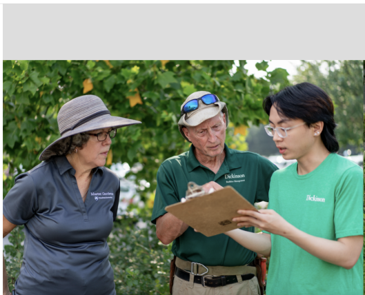
Curriculum: Partnerships for data collection for lab courses, Kaufman Pollinator Garden, July 2023.

active participation and fostering a deeper appreciation for the complexity of pollinator interactions and sustainable gardening practices. 10/25/2023: Pollinator Garden Work Day: Put the Garden to Bed (17 Participants) During the "Garden Work Day – Put the Garden to Bed," participants actively prepared the garden for the winter season while learning valuable gardening techniques. Sponsored by the Center for Sustainability Education (CSE) and Penn State Master Gardeners, the event focused on engaging students and staff in essential end-of-season tasks, including seed harvesting and garden winterization. Attendees gained hands-on experience in these critical gardening practices, contributing to the garden's maintenance and long-term health. The day's activities combined practical work with educational opportunities, fostering a greater understanding of seasonal garden care and promoting continued involvement in gardening initiatives.