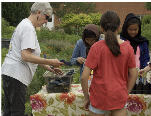
Service Learning: Garden work day and planting for Youth Camp from community, July 2023.