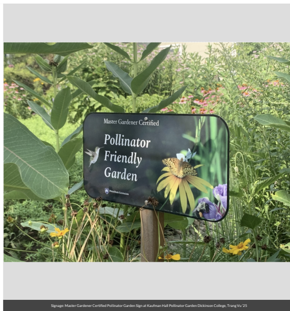
Signage: Master Gardener Certified Pollinator Garden Sign at Kaufman Hall Pollinator Garden Dickinson College, Trang Vu '25