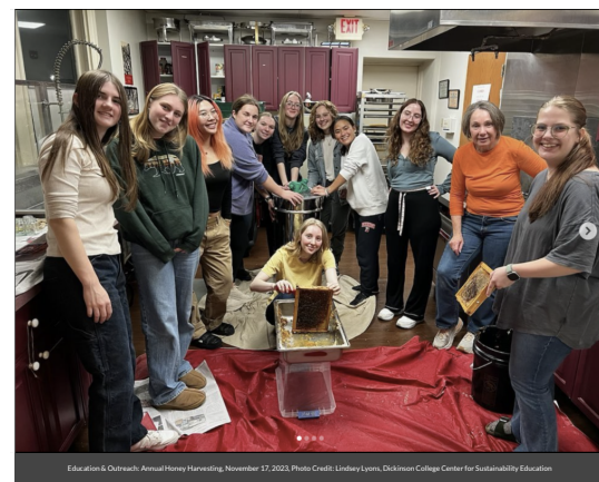
Education & Outreach: Annual Honey Harvesting, November 17, 2023.