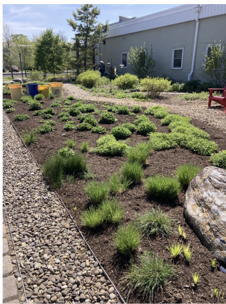
Pollinator Habitat: Early Spring Kaufman Pollinator Garden Habitat, April 2023, Photo Credit: Lindsey Lyons, Dickinson College Center for Sustainability Education