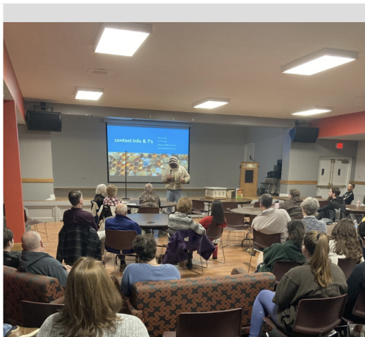
Curriculum: Guest lecture from local beekeeper provided extra credit opportunity for Environmental Studies Classes, November 2023.