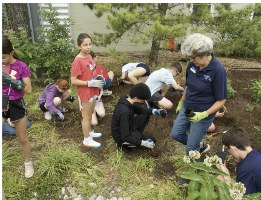
Service Learning: Garden work day and planting for Youth Camp from community, July 2023.