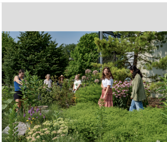
Pollinator Habitat: Kaufman Pollinator Garden Habitat, August 2023, Photo Credit: Dah Loh, Dickinson College