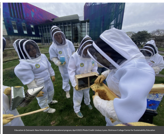
Education & Outreach: New Hive Install and educational program, April 2023.