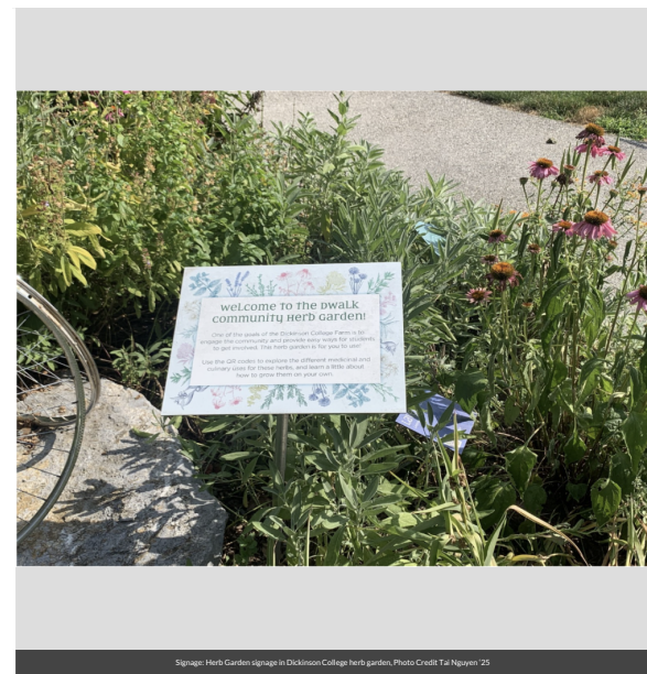
Signage: Herb Garden signage in Dickinson College herb garden