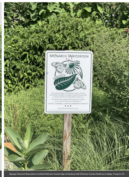
Signage: Monarch Waystation Certified Pollinator Garden Sign at Kaufman Hall Pollinator Garden Dickinson College, Trang Vu '25