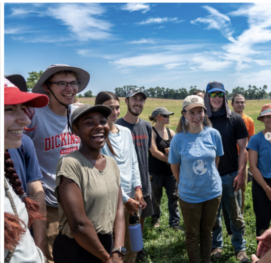
Curriculum: Class visit to the Dickinson College Farms to explore vegetable and herb production using IPM. July 2023.