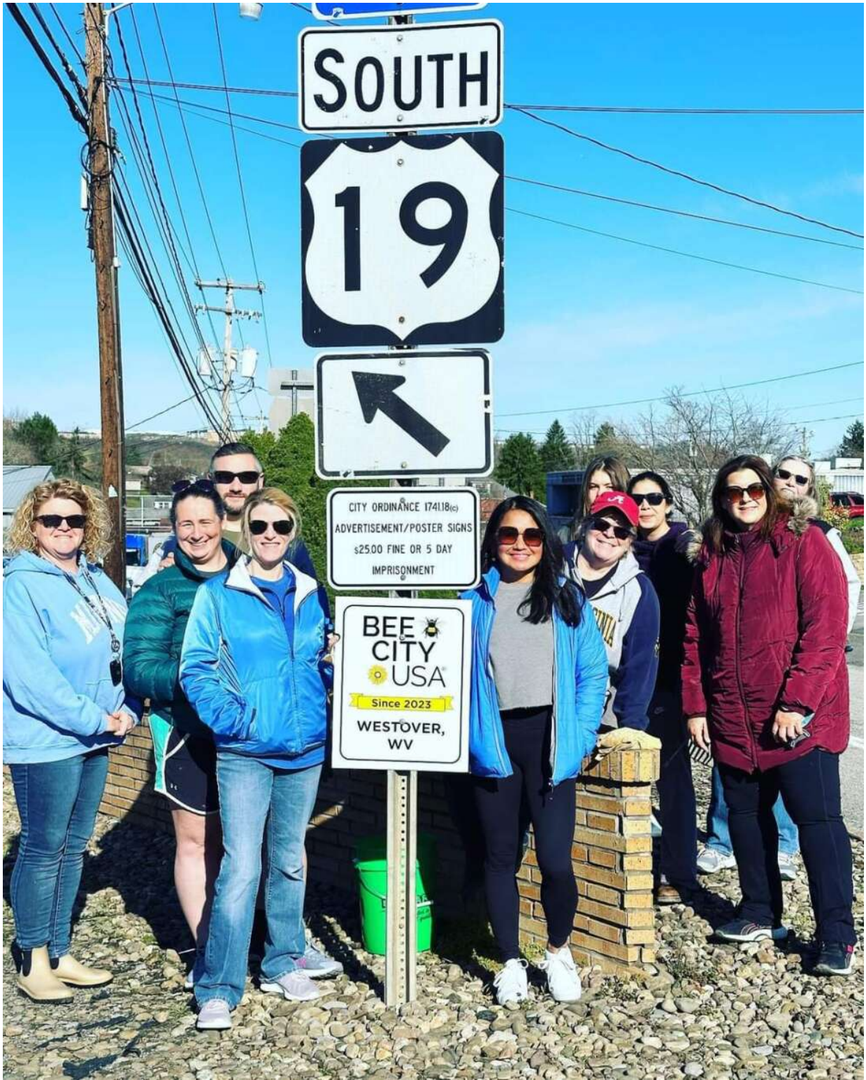
Volunteers and members of the Pollinator Committee