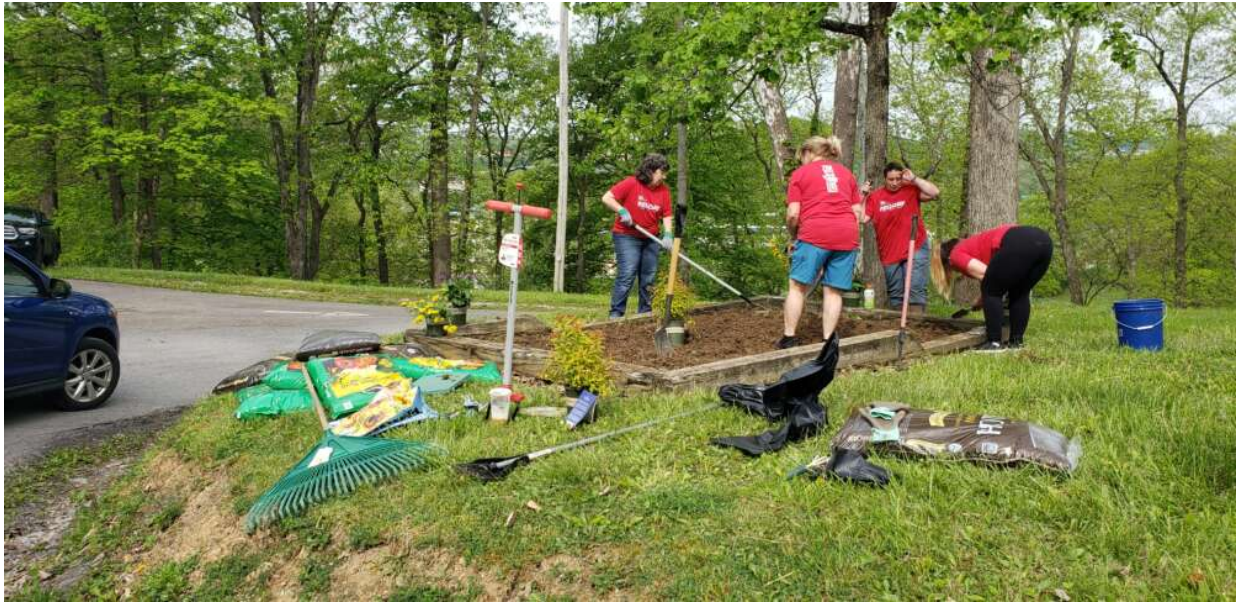
Planting pollinator habitat without use of chemicals