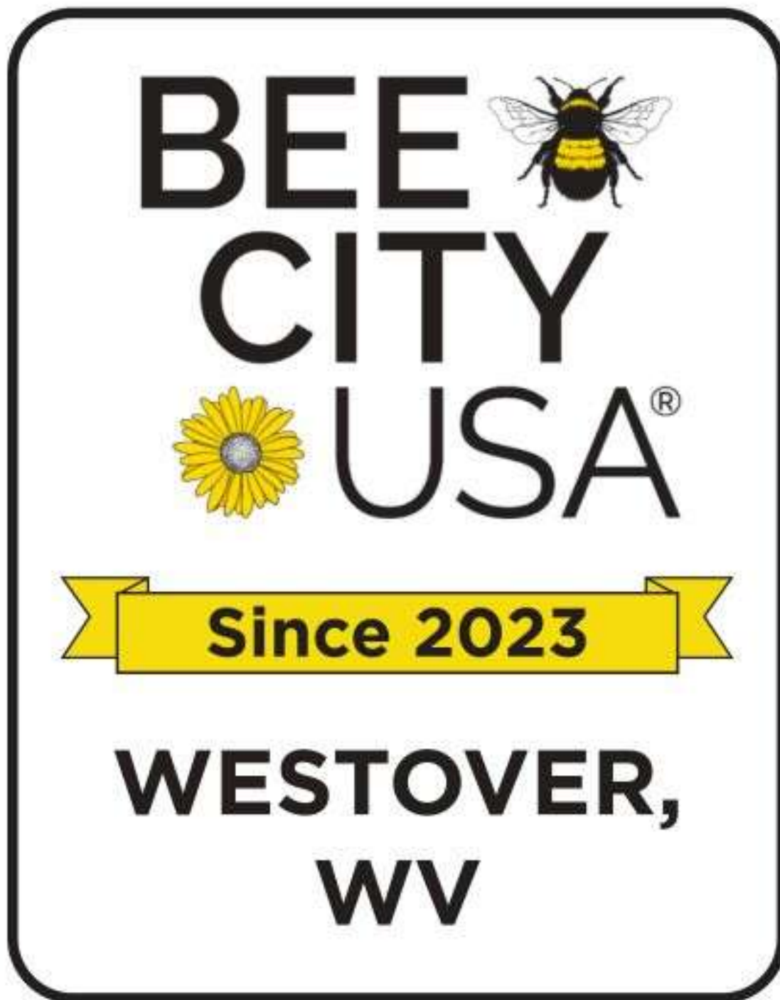
Bee City USA sign in Westover, WV at The Triangle, proof by Morgantown Blueprint