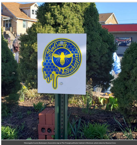
Monongalia County Beekeepers Association sign at The Triangle pollinator habitat in Westover