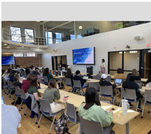
A speaker from the US Fish and Wildlife Service presents to students and community members.