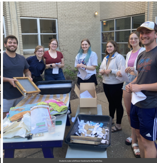
Students make wildflower bookmarks for Earth Day.