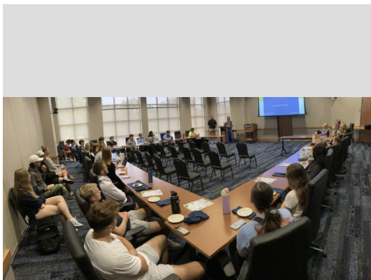
A speaker with local conservation non-profit Nahant Marsh presents to students and community members.