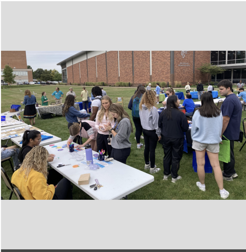
Student Class projects during Earth Day engaged with the rest of campus and our community over sustainable practices