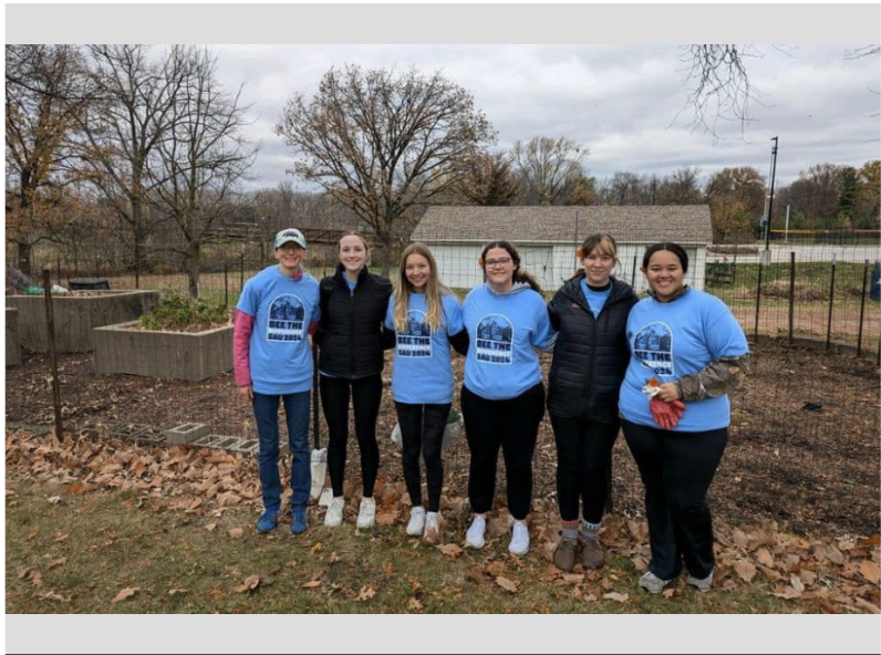
Student clean up the garden space and adjacent gardens for partners in the Diocese in fall 2024