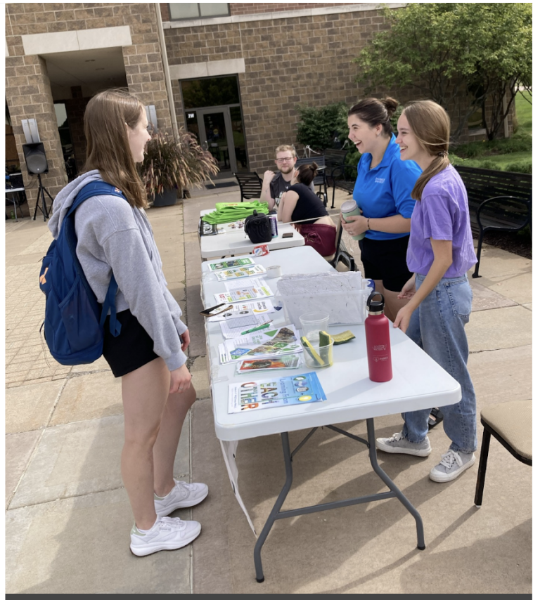
Student Class projects during Earth Day engaged with the rest of campus and our community over sustainable practices