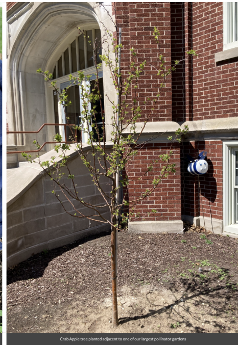
Crab Apple tree planted adjacent to one of our largest pollinator gardens.