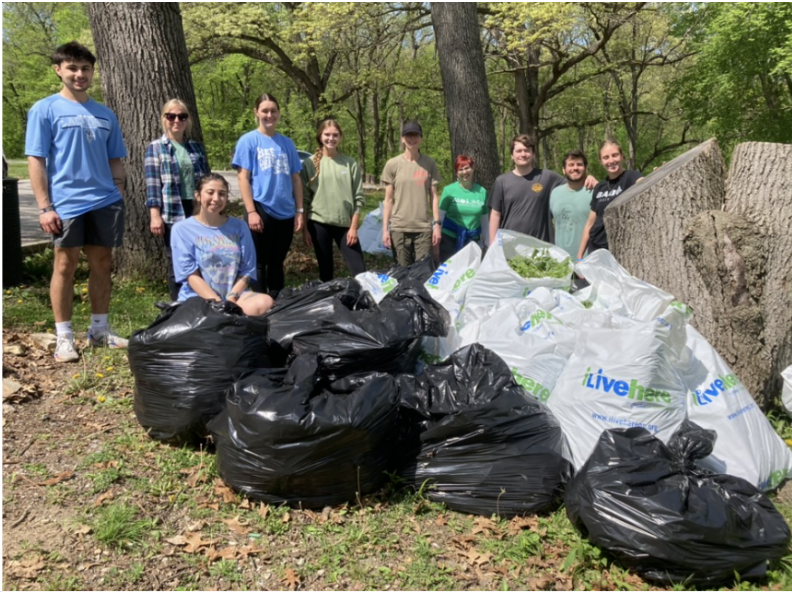
Students and faculty remove garlic mustard for the City of Davenport in spring 2024.