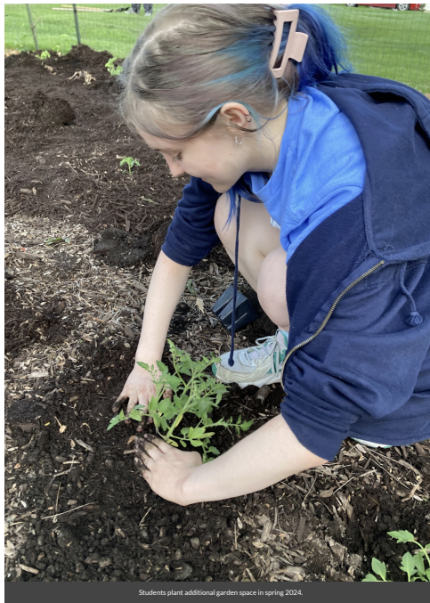
Students plant additional garden space in spring 2024.