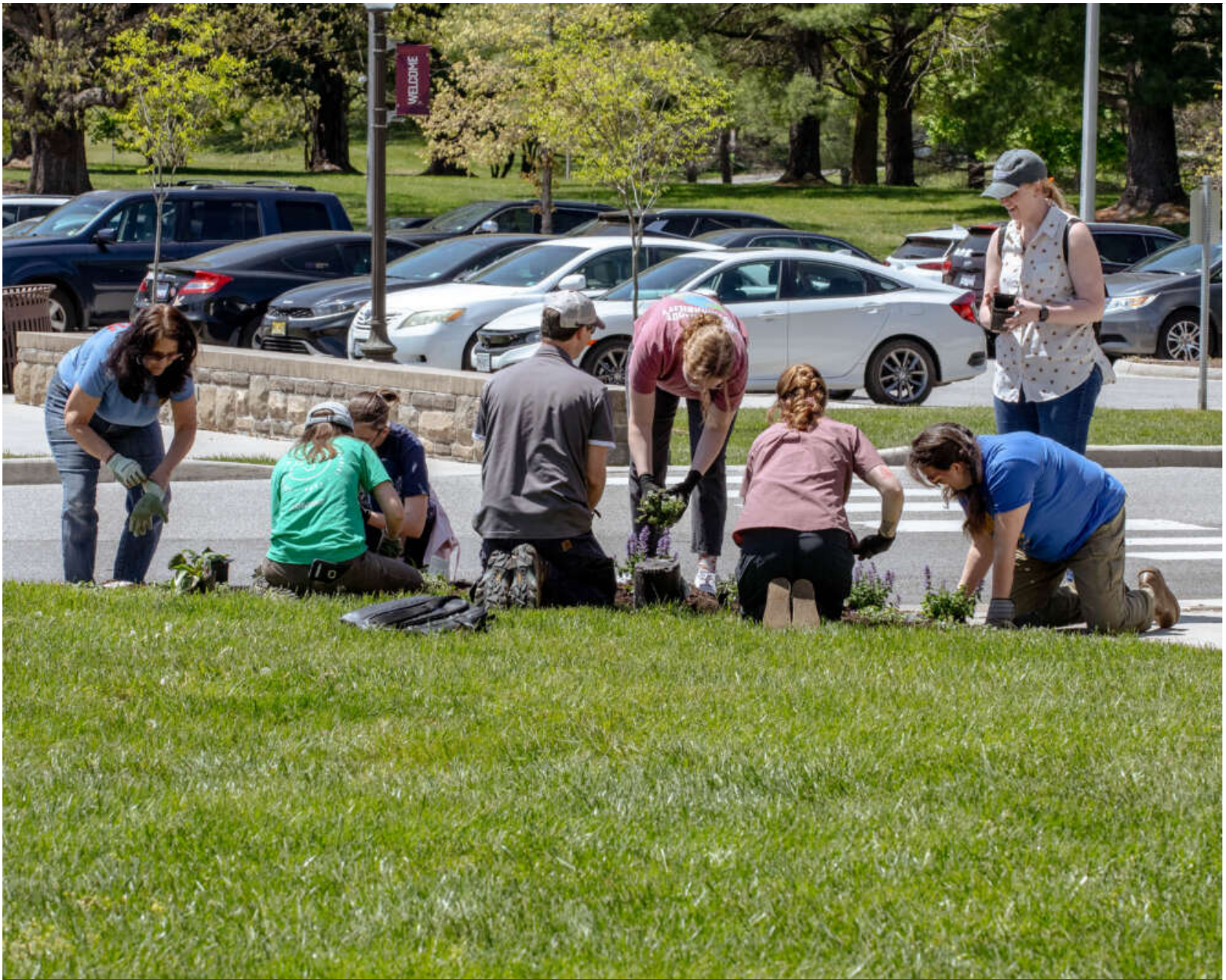
Volunteers help create pollinator habitat at the Visitors Center as part of VT Bee Day