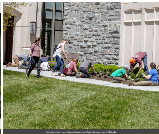
Volunteers help create pollinator habitat at the Visitors Center as part of VT Bee Day.