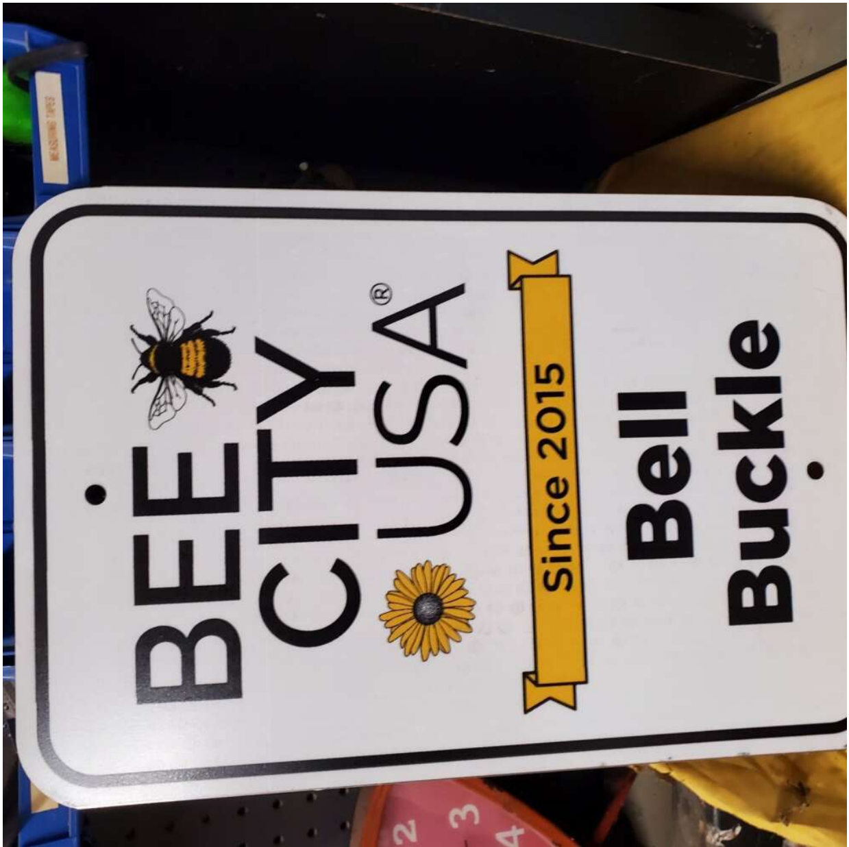
Bell Buckle Bee City USA sign.