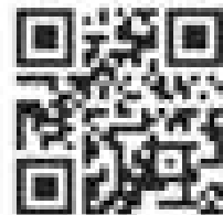
A Pollinator Pledge in which residents are encouraged to participate.