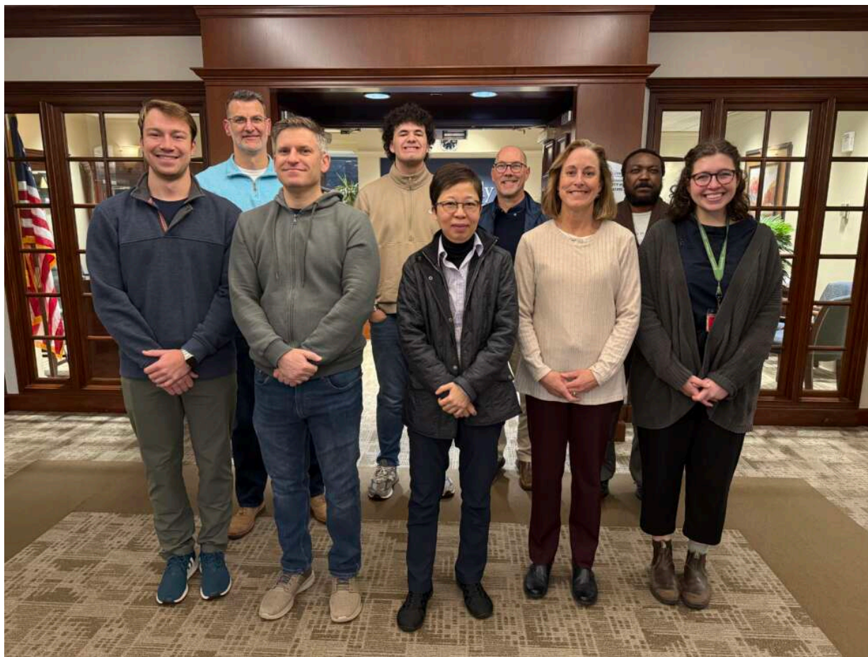
City of Dunwoody Sustainability Committee with city staff.