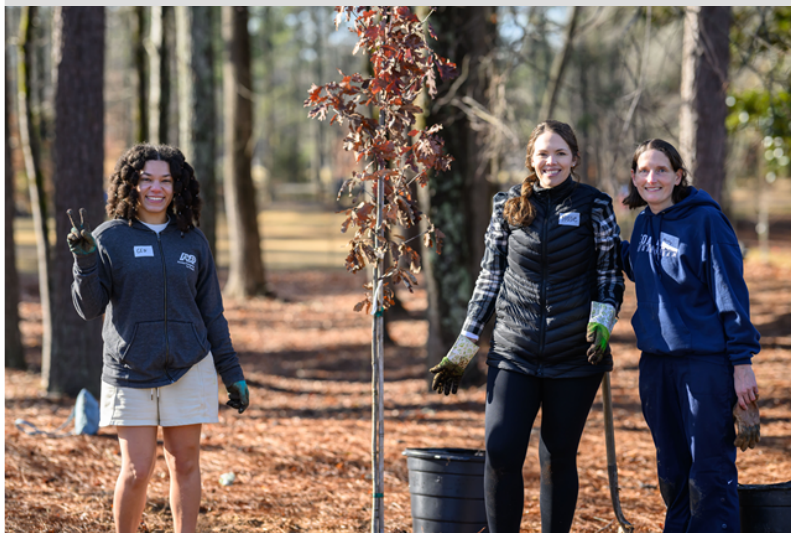
Volunteers doing plantings on Martin Luther King, Jr. Day.