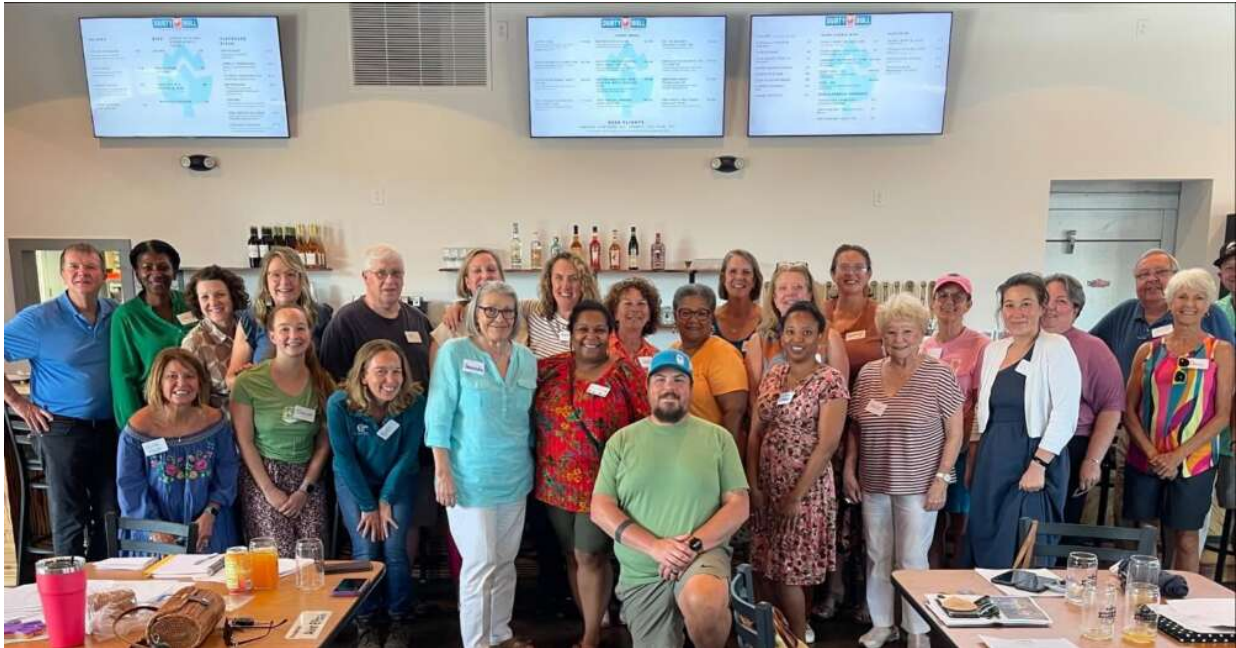
This is the entire Keep Gastonia Beautiful board, we have a Bee City USA committee within the board.