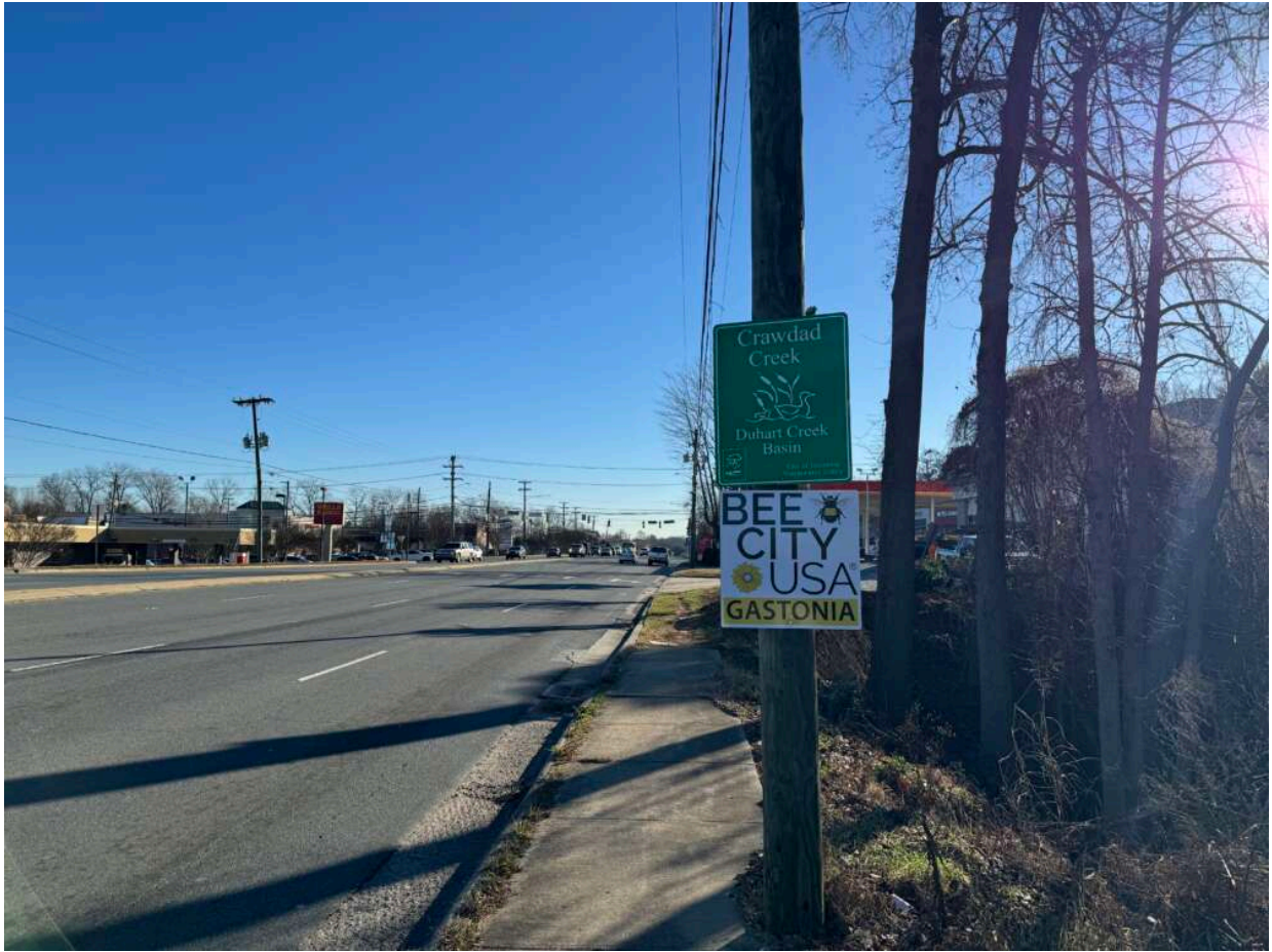
One of our signs near one of the busiest intersections in the town (taken early in the a.m.)