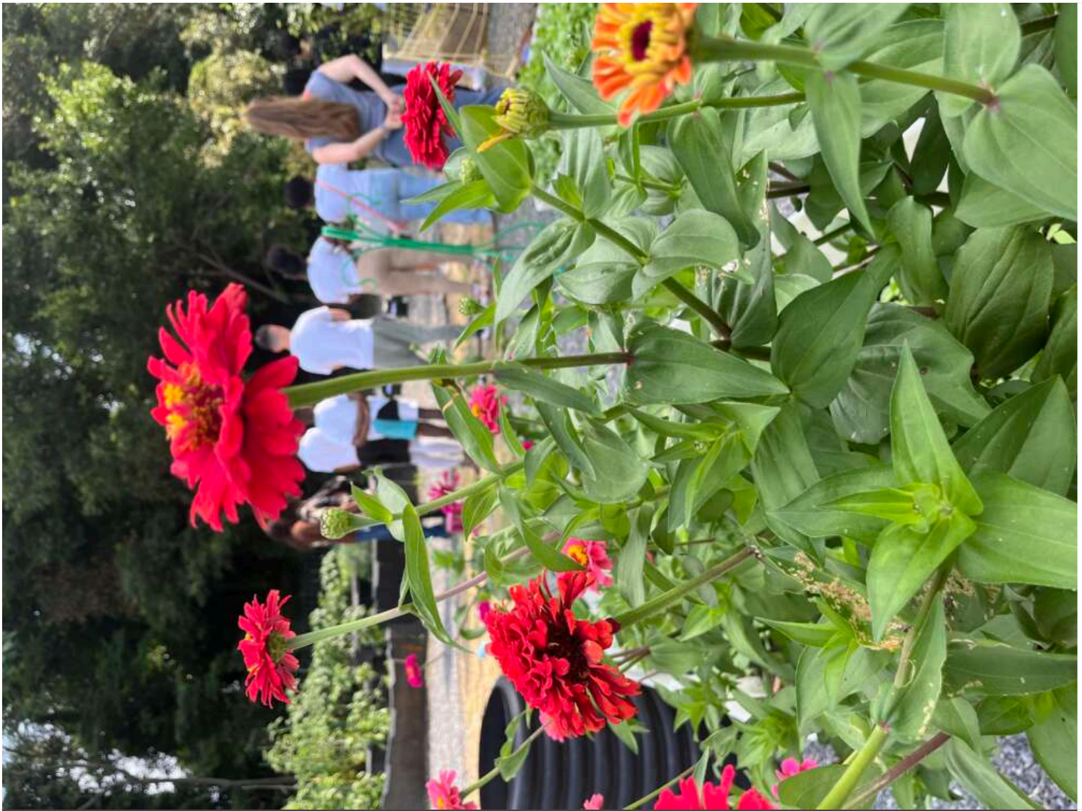
Students gathered in our community garden near our planting kindness beds.