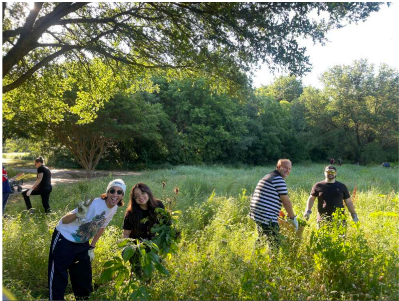
Team members from Meow Wolf Grapevine removed invasive plants from pollinator habitat.