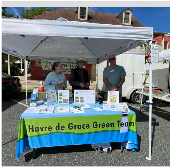
table at Farmers market, answered questions, recruited, promoted activities