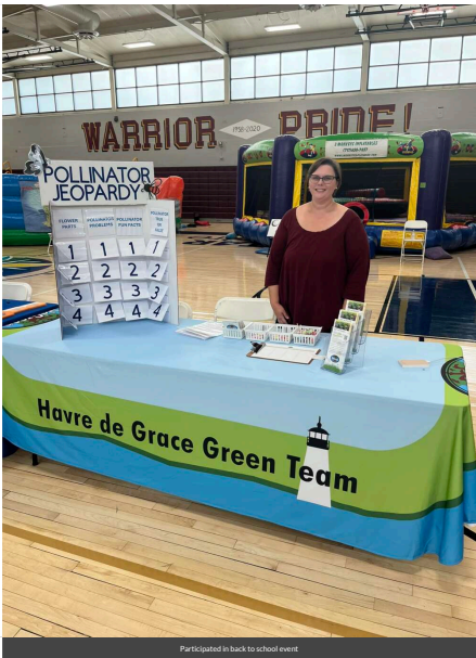
Participated in back to school event