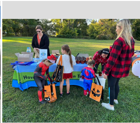
participated in Trunk or Treat