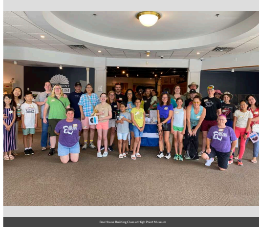
Bee House Building Class at High Point Museum