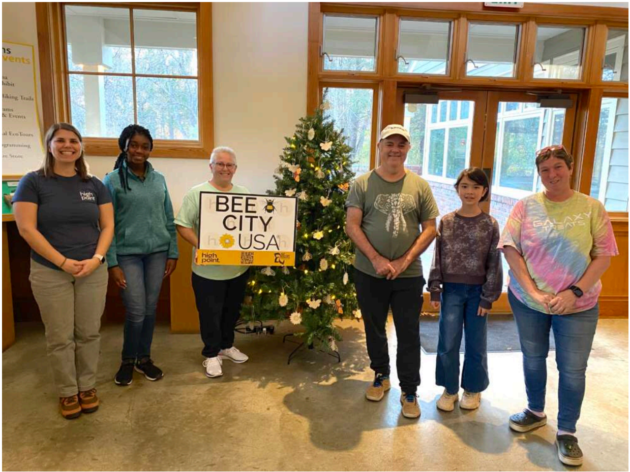
Bee-autiful Committee Members!