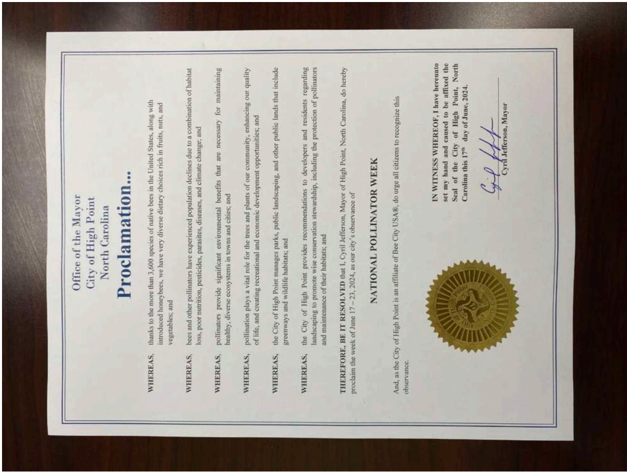
Pollinator Proclamation 2024

Any lessons learned you would like to share?