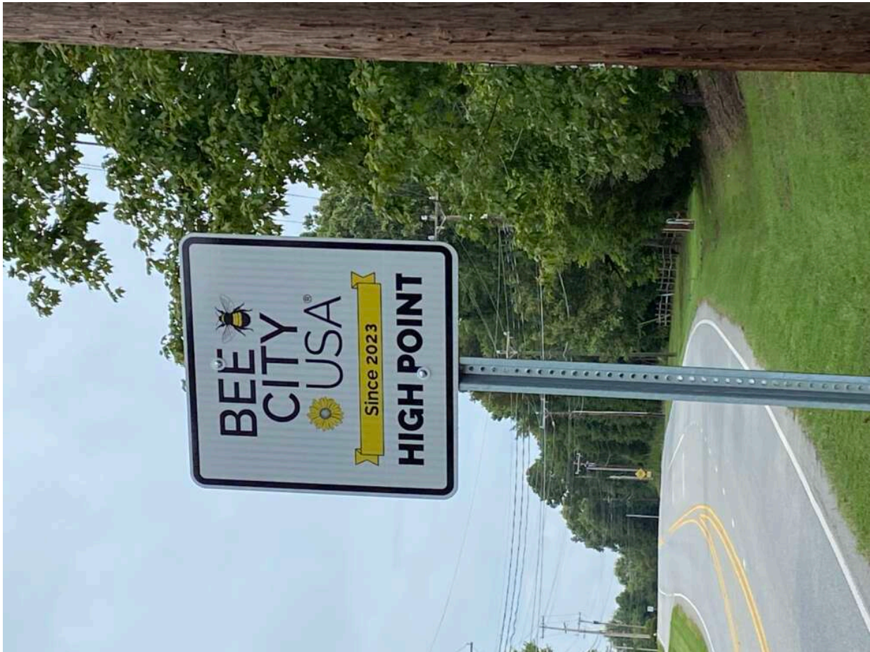
Street sign at the Piedmont Environmental Center