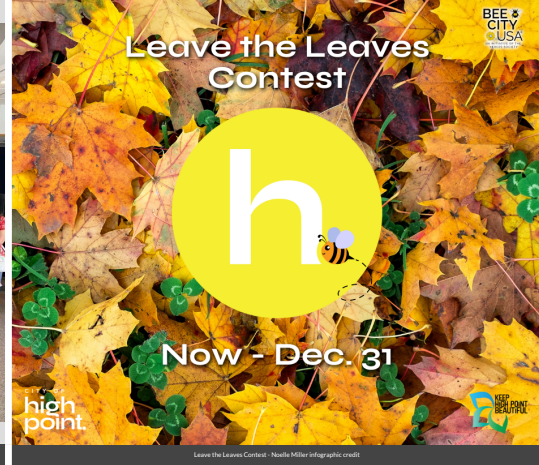
Leave the Leaves Contest - Noelle Miller infographic credit