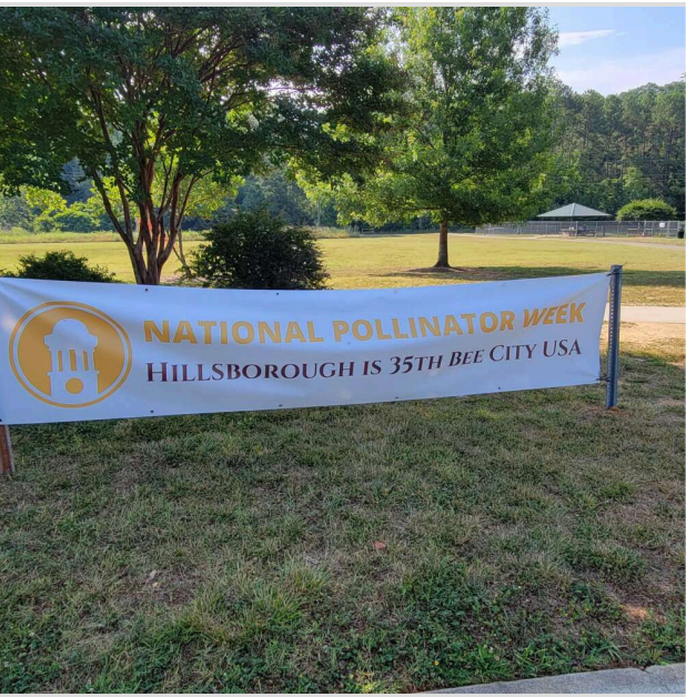
National Pollinator Week banner at local park