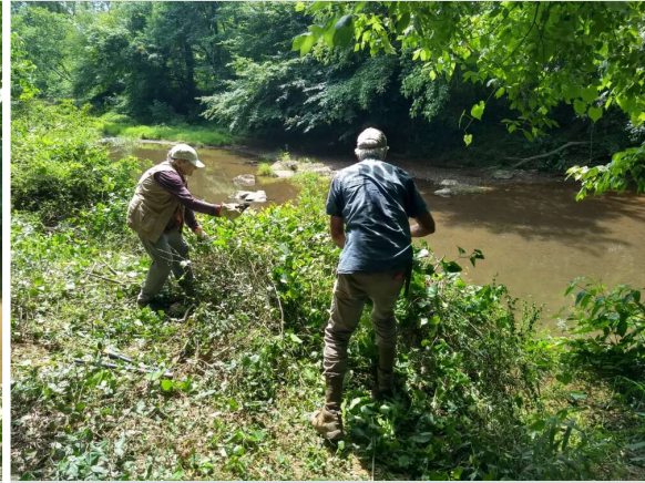
Weekly volunteer led plantings and invasive removal project