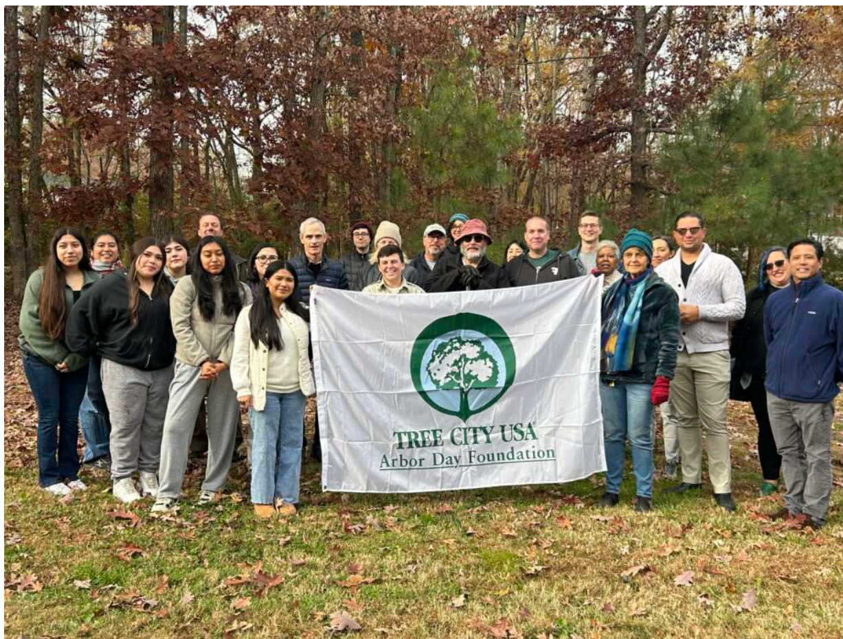
Tree Board and Volunteers at a planting event