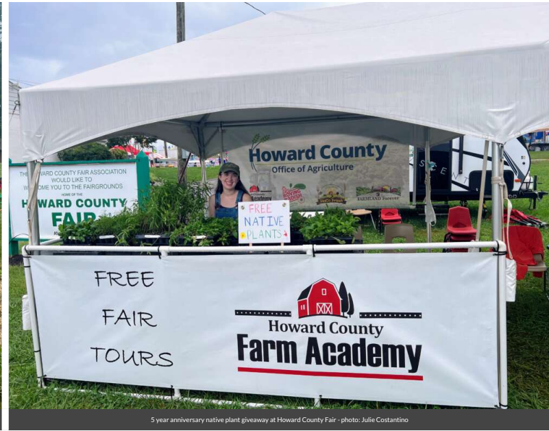
5 year anniversary native plant giveaway at Howard County Fair