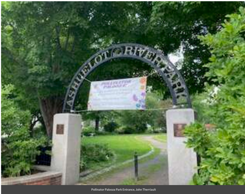
Pollinator Palooza Park Entrance