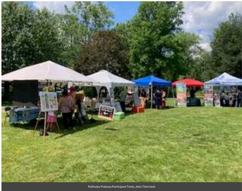
Pollinator Palooza Participant Tents