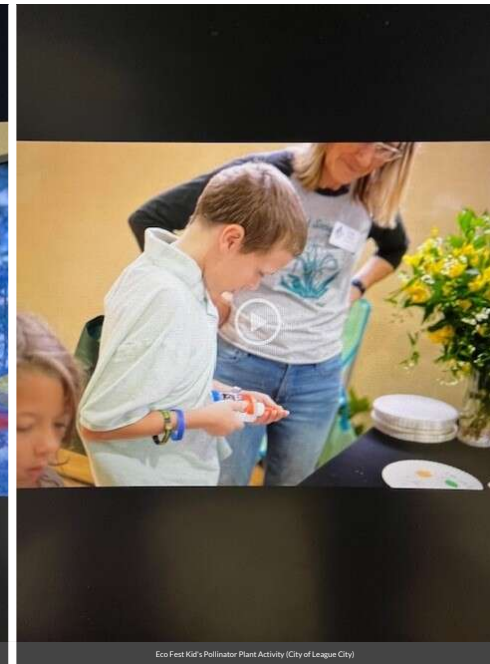
Eco Fest Kid's Pollinator Plant Activity (City of League City)