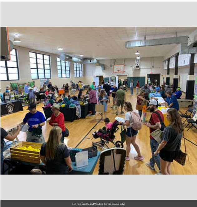
Eco Fest Booths and Vendors (City of League City)