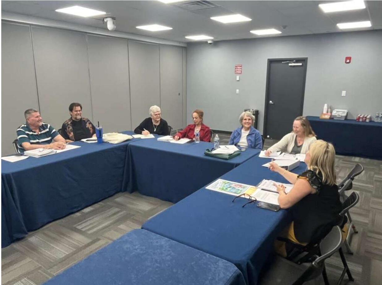
Bee City USA Committee Meeting (City of League City)