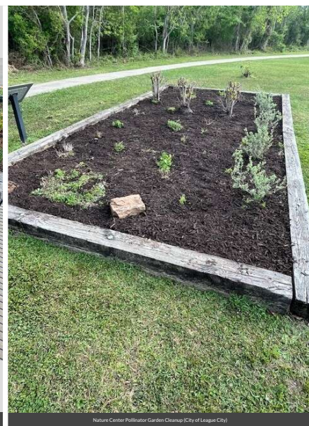
Eagle Scout Pollinator Project 2024 (City of League City)