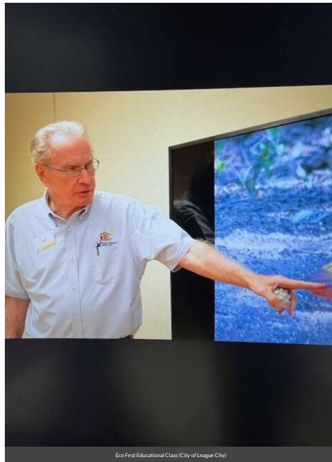
Eco Fest Educational Class (City of League City)